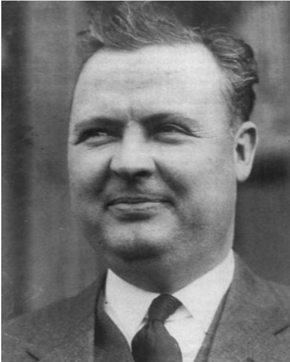
D.C. Stephenson, grand wizard of the Klu Klux Klan in Indiana and other northern states during the height of Klan power in the 1920s, is seen in this Dec. 12, 1922, Indianapolis Star photo.