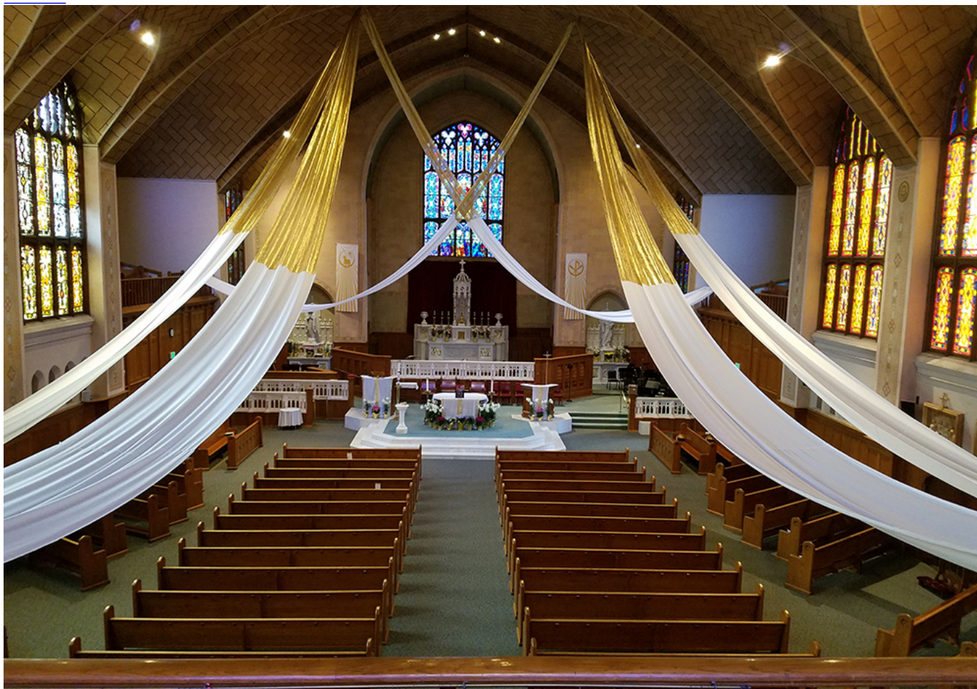
St. Ignatius of Loyola Parish's sanctuary, decorated for Easter