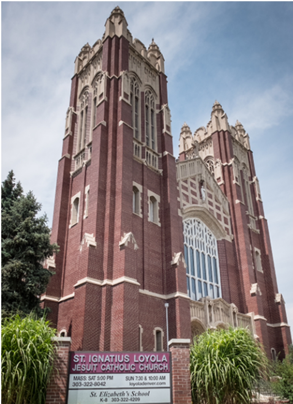
The exterior of St. Ignatius of Loyola Parish in Denver

"This is not an action I take lightly. This decision comes only after many years of discernment and conversations," wrote Greene.