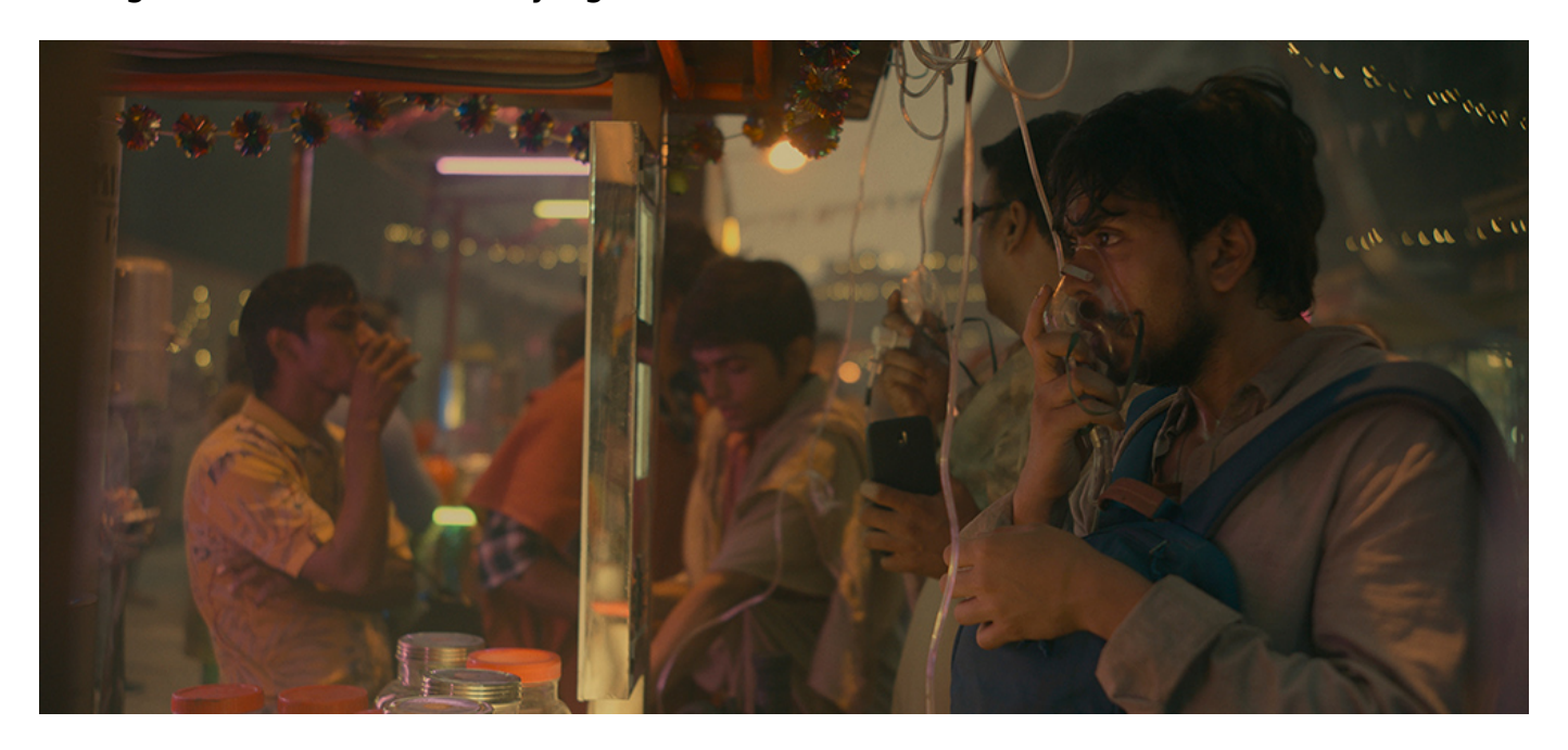
Adarsh Gourav in "Extrapolations"

Through intimate stories driven by personal relationships, Fortenberry said, " 'Extrapolations' was an attempt to try to capture in a TV show: What are the changes that come from staying the same?"