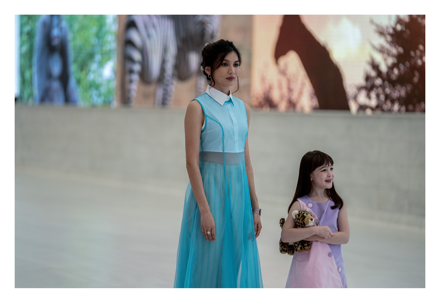
Gemma Chan in "Extrapolations"

You can go to a place of emotion more easily with a narrative, and then you can get to a place of relationship. All of "Extrapolations" episodes focus on different kinds of relationships — romantic relationships, parent-child relationships, work colleague relationships, unlikely friends, religious community. Part of what we're trying to show is the challenges to relationships that climate change creates.