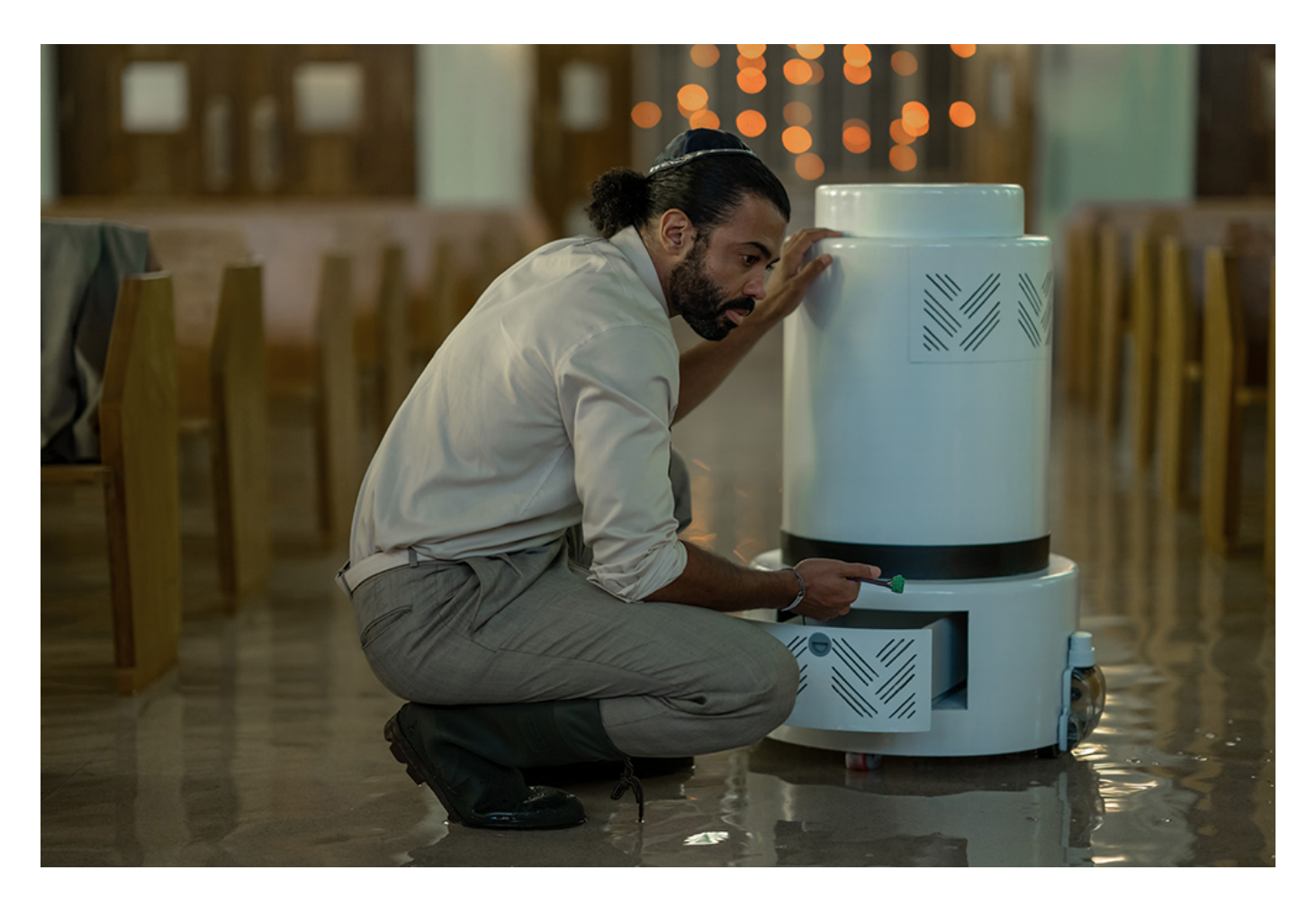
Daveed Diggs in "Extrapolations"

Kids who are growing up now are going to have an awareness of what's going on with the climate by the time they're teenagers. They're going to have an awareness that a lot of this was created by previous generations, not them. And yet, they're going to have to deal with the repercussions.