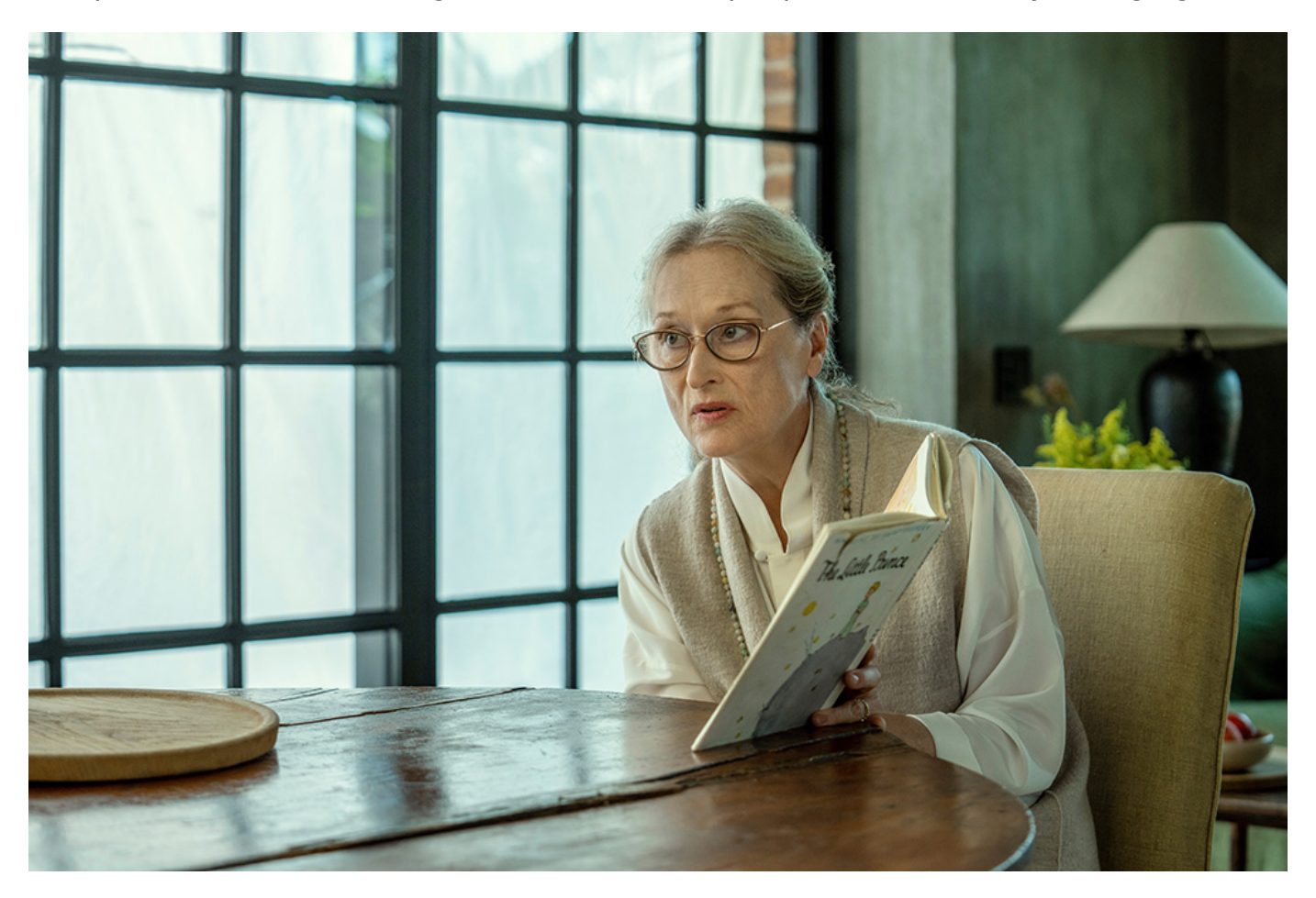
Meryl Streep in "Extrapolations"

In some ways, what the show is positing is that people and people's creativity and people's endless capacity for innovation is part of how we got here. People don't stay put. Whales have been living whale lives and repeating patterns of migration and patterns of child rearing for centuries, and people are constantly changing.