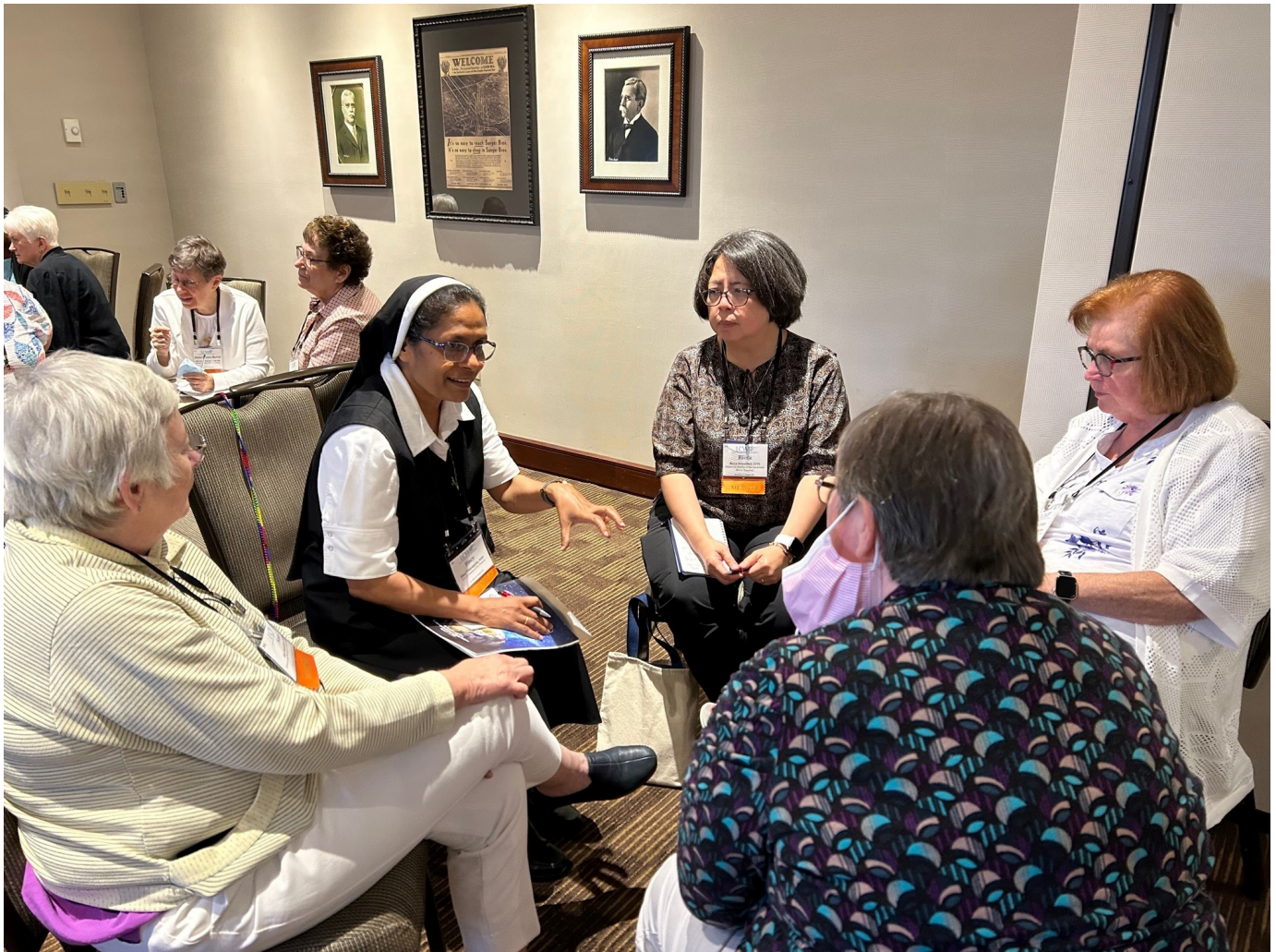
A roundtable discussion during the breakout session on intercultural leadership at the 2023 LCWR assembly in Dallas