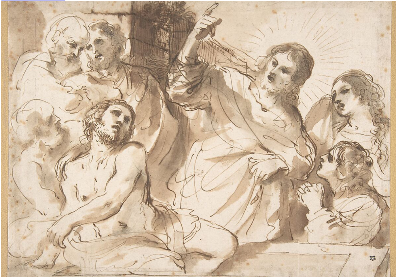
"The Raising of Lazarus," circa 1619 by Guercino (Giovanni Francesco Barbieri) (Metropolitan Museum of Art)