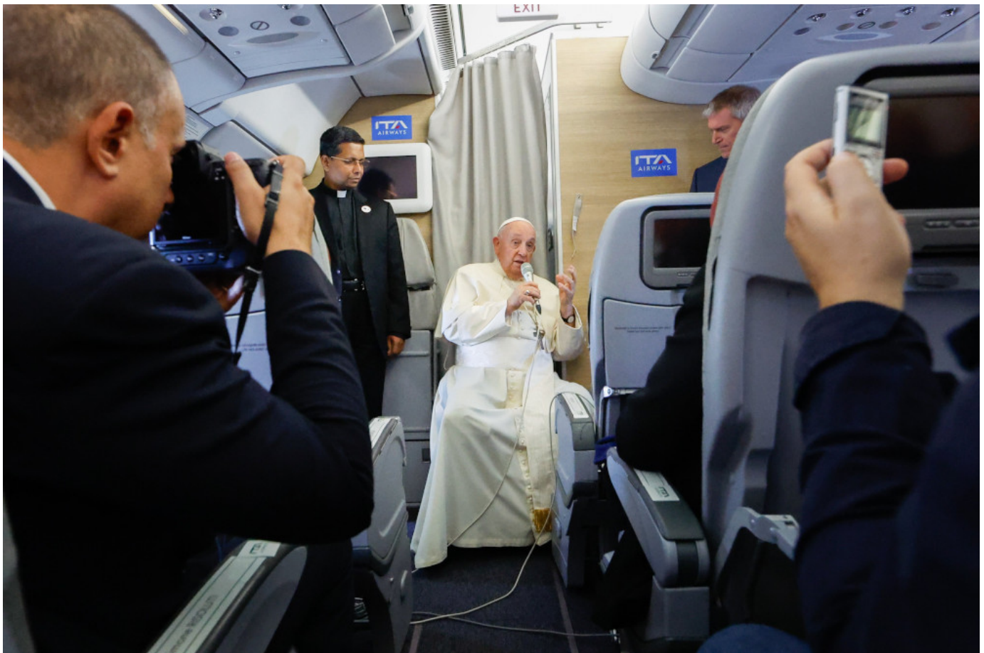
Pope Francis answers questions from journalists aboard his flight back to Rome from Ulaanbaatar, Mongolia, Sept. 4, 2023.

"Detaching from the journey of communion is ideology," the pope warned.