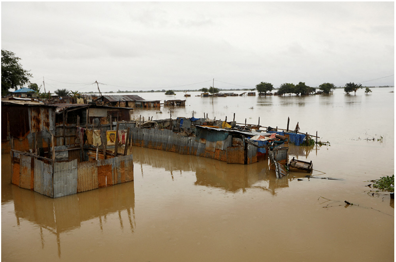
Houses are seen submerged in floodwaters in Lokoja, Nigeria, Oct.13, 2022.

Nigeria, the continent's most populous nation, is particularly vulnerable to the effects of climate change, and will take the biggest hit as data shows that climate change could reduce gross domestic product per capita by about 15% by 2050 in countries across East and West Africa.