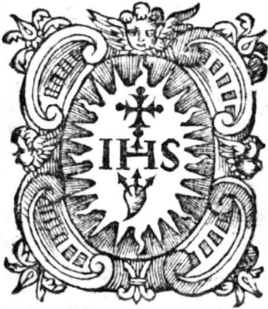
Emblem of the Society of Jesus, from a 1586 print