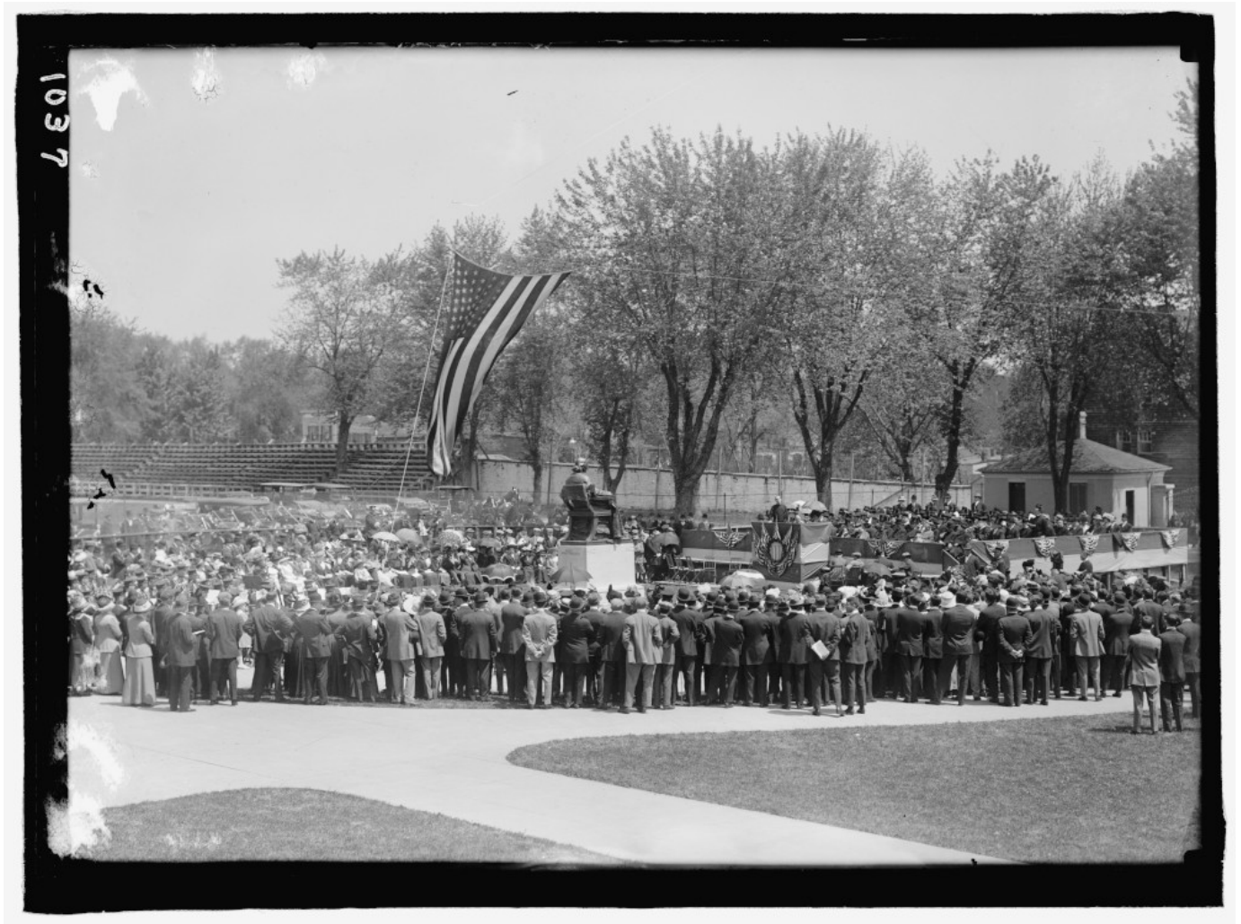
A photo of the May 4, 1912, dedication of the John Carroll statue at Georgetown University.