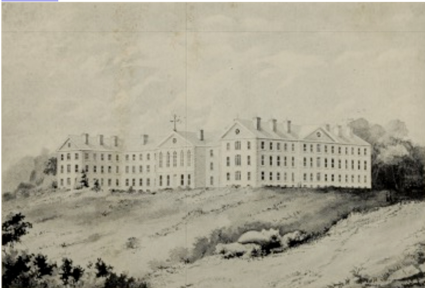
Drawing of Woodstock College in Woodstock, Maryland, in 1871