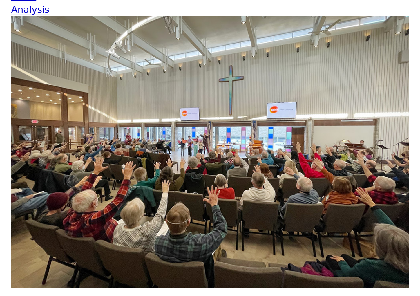
Spirit Catholic Community in Minneapolis blesses children and families baptized on Epiphany in 2023.