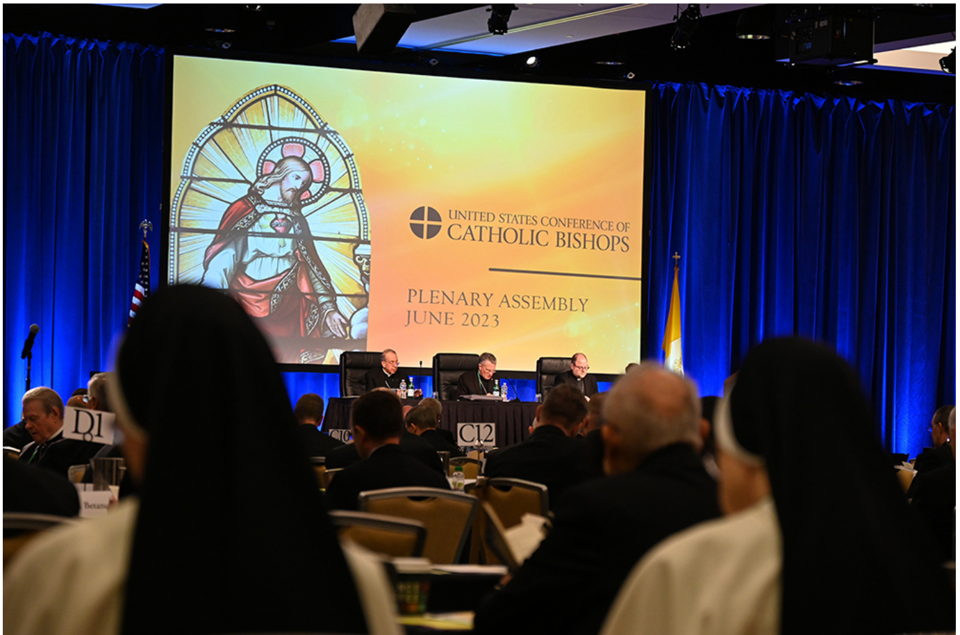
Two nuns, foreground, attend the U.S. Conference of Catholic Bishops meeting in Orlando, Florida, June 15.