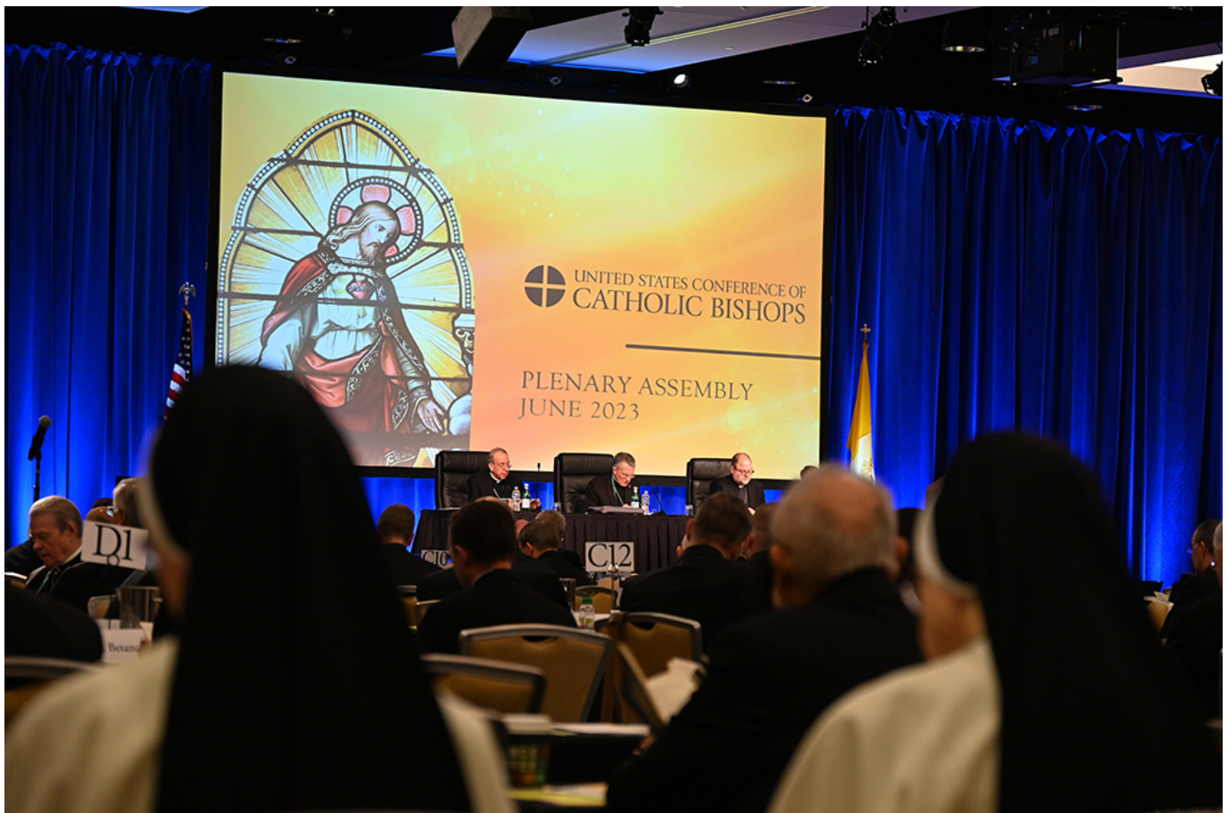
Two nuns, foreground, attend the U.S. Conference of Catholic Bishops meeting in Orlando, Florida, June 15.