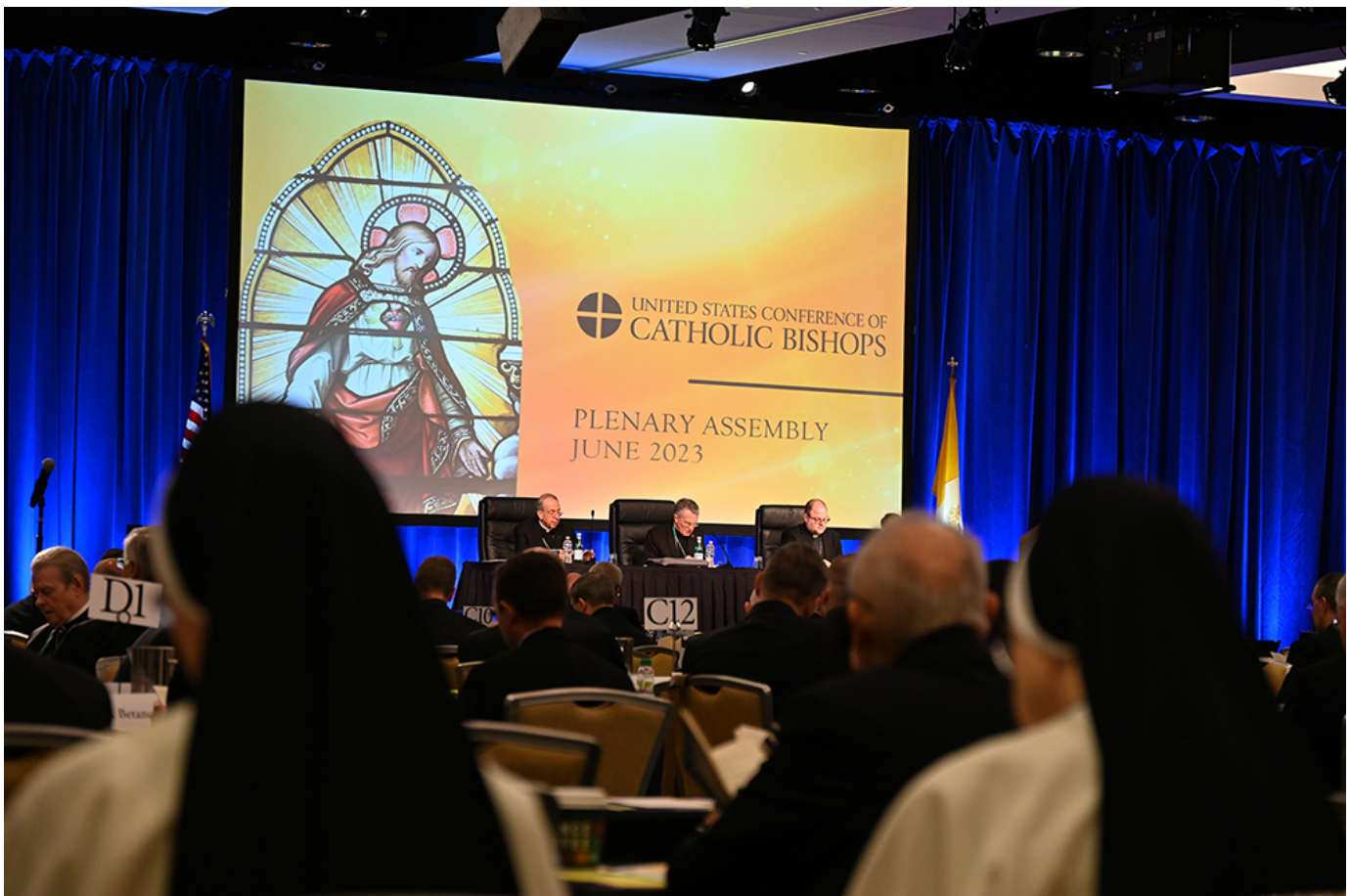
Two nuns, foreground, attend the U.S. Conference of Catholic Bishops meeting in Orlando, Florida, June 15.