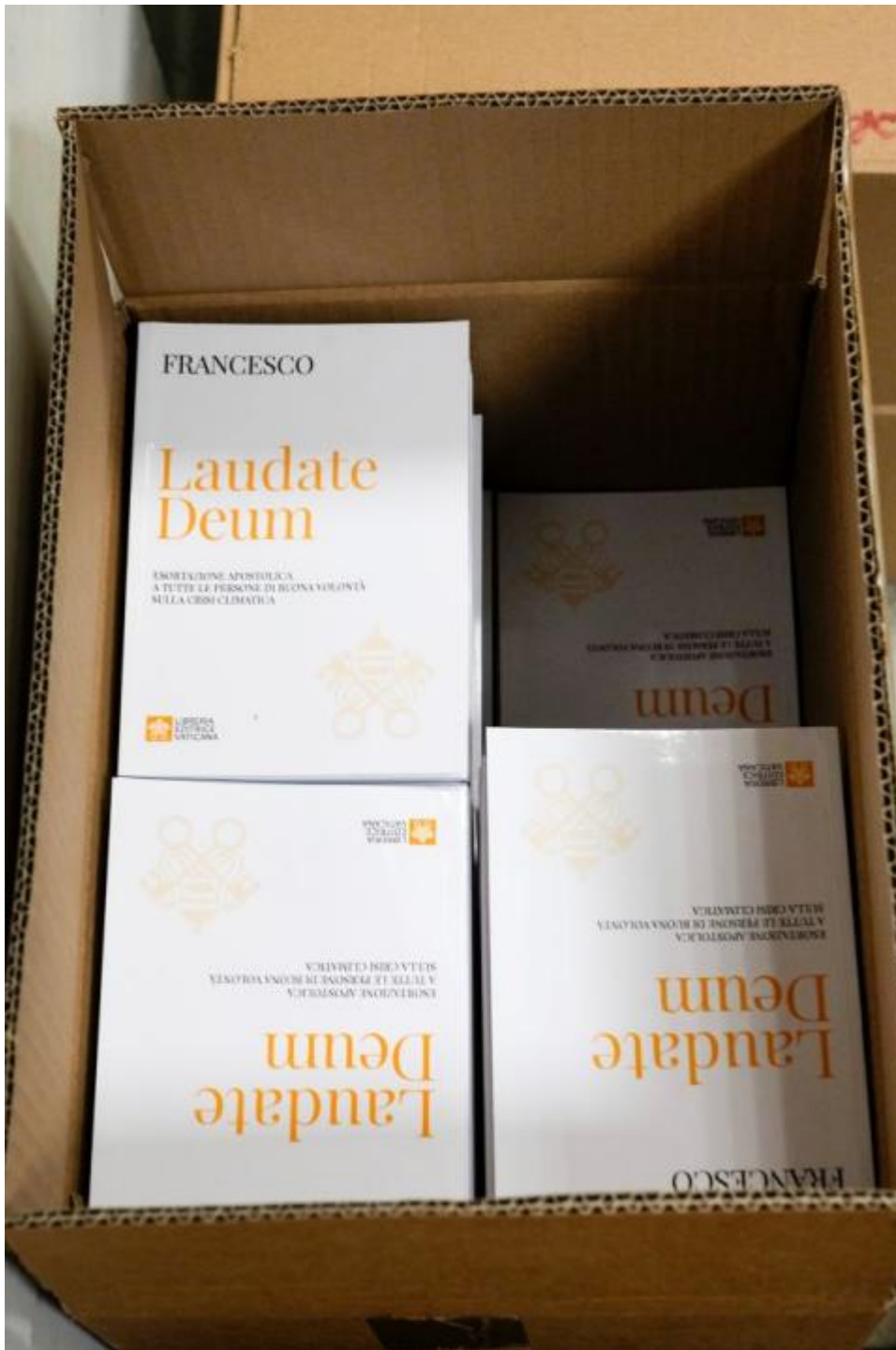
Copies of Pope Francis' latest letter on the environment, "Laudate Deum," are seen in a bookshop in Rome, Oct. 4, 2023.