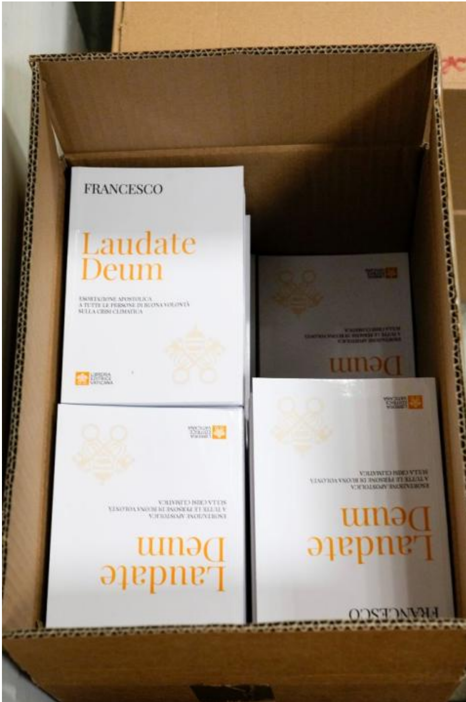
Copies of Pope Francis' latest letter on the environment, "Laudate Deum," are seen in a bookshop in Rome, Oct. 4, 2023.