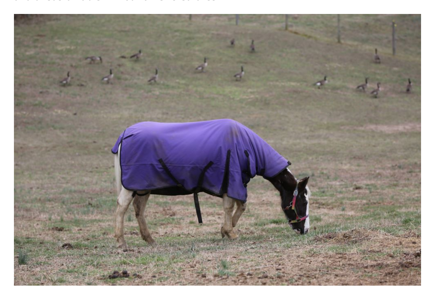
A horse grazes in a field amid geese on a farm in Huntingtown, Md., March 11, 2022.

"The Judaeo-Christian vision of the cosmos defends the unique and central value of the human being amid the marvelous concert of all God's creatures, but today we see ourselves forced to realize that it is only possible to sustain a 'situated anthropocentrism'. To recognize, in other words, that human life is incomprehensible and unsustainable without other creatures."