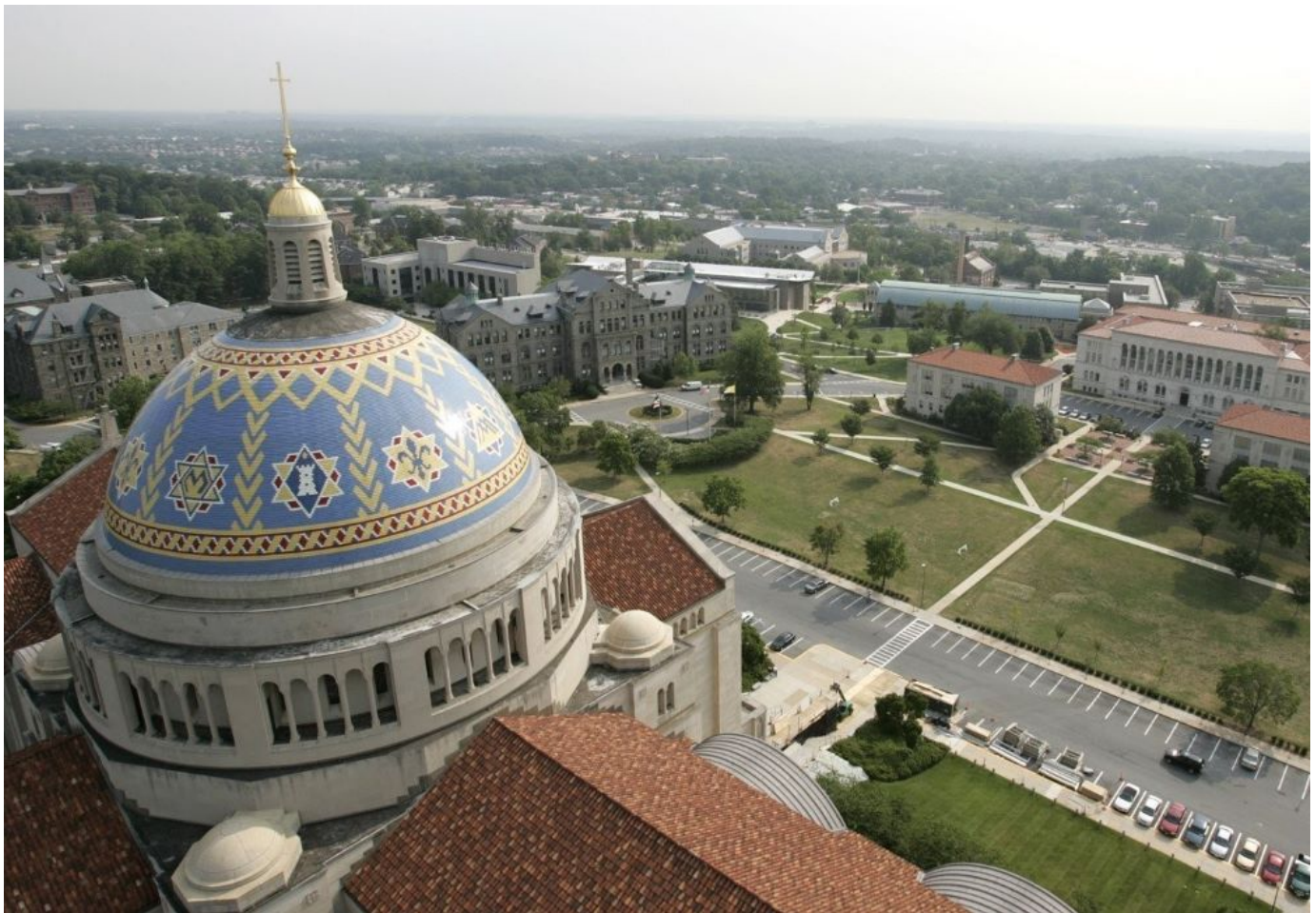
Catholic University of America is seen from the bell tower of the Basilica of the National Shrine of the Immaculate Conception.