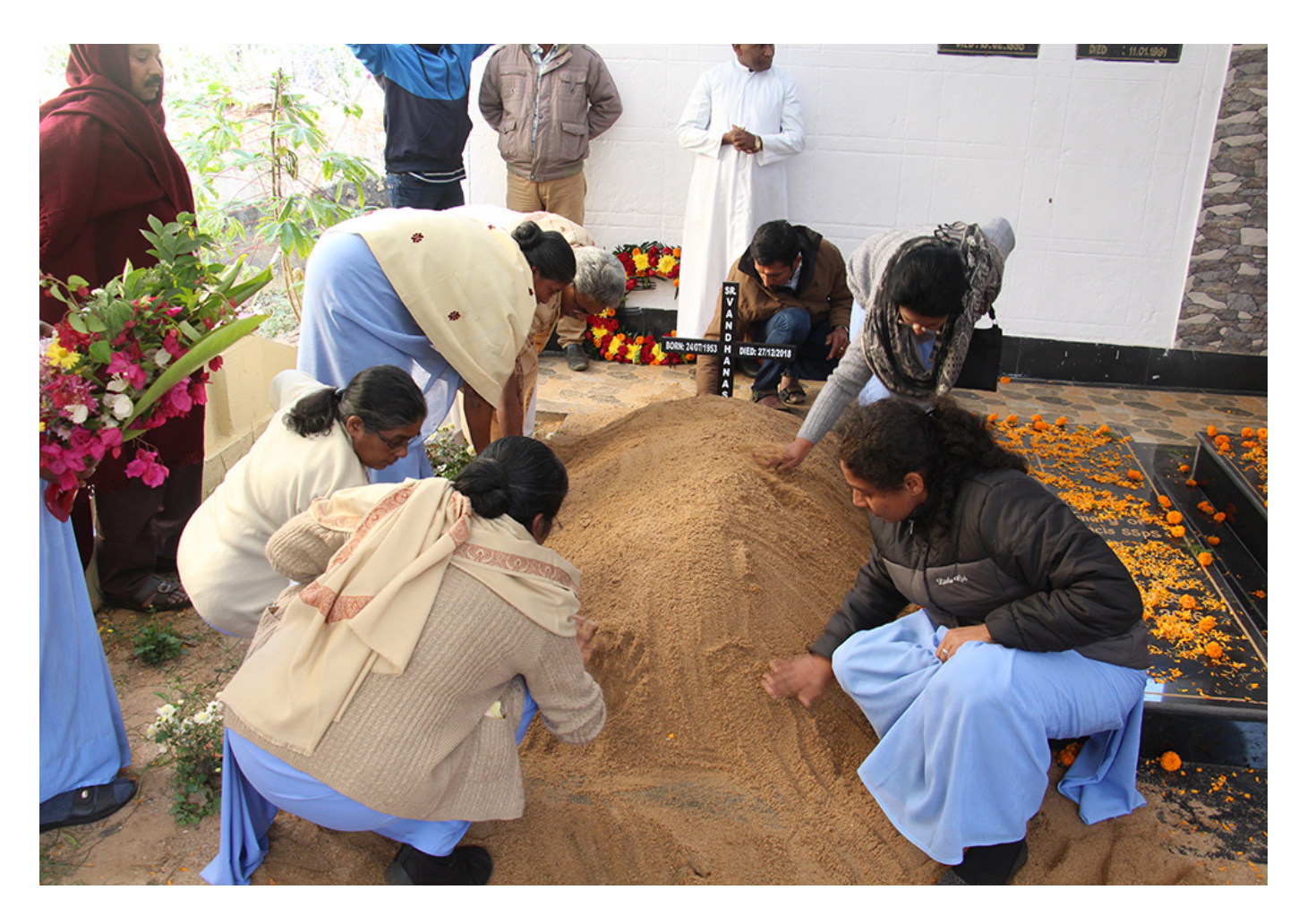
Sisters arrange flowers and level mud with their hands in Odisha (in the east of India), at the tomb of one of the sisters.

When we fail to live in the present moment as grace, we allow our egos to take over and our relationships with others can suffer. In the competitive race of pursuing the best, we trample on many people's feelings. Does it happen only in the career field? No, it's more frequent in our own close circles than at workplaces. Derogatory remarks, the denial of deserved acknowledgement, missed opportunities, betrayals, discrimination, and similar actions can push a person to the brink of a near-death experience. It's the murder of the personality, and in this case, the pain impacts the victim alone, while others remain unaffected.