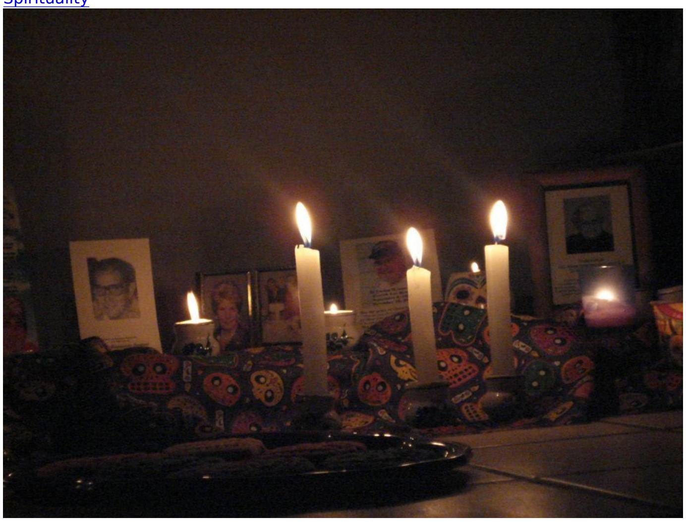
Day of the Dead altar at Benedictine Monastery Pan de Vida [Bread of Life] in Torreon, Mexico.