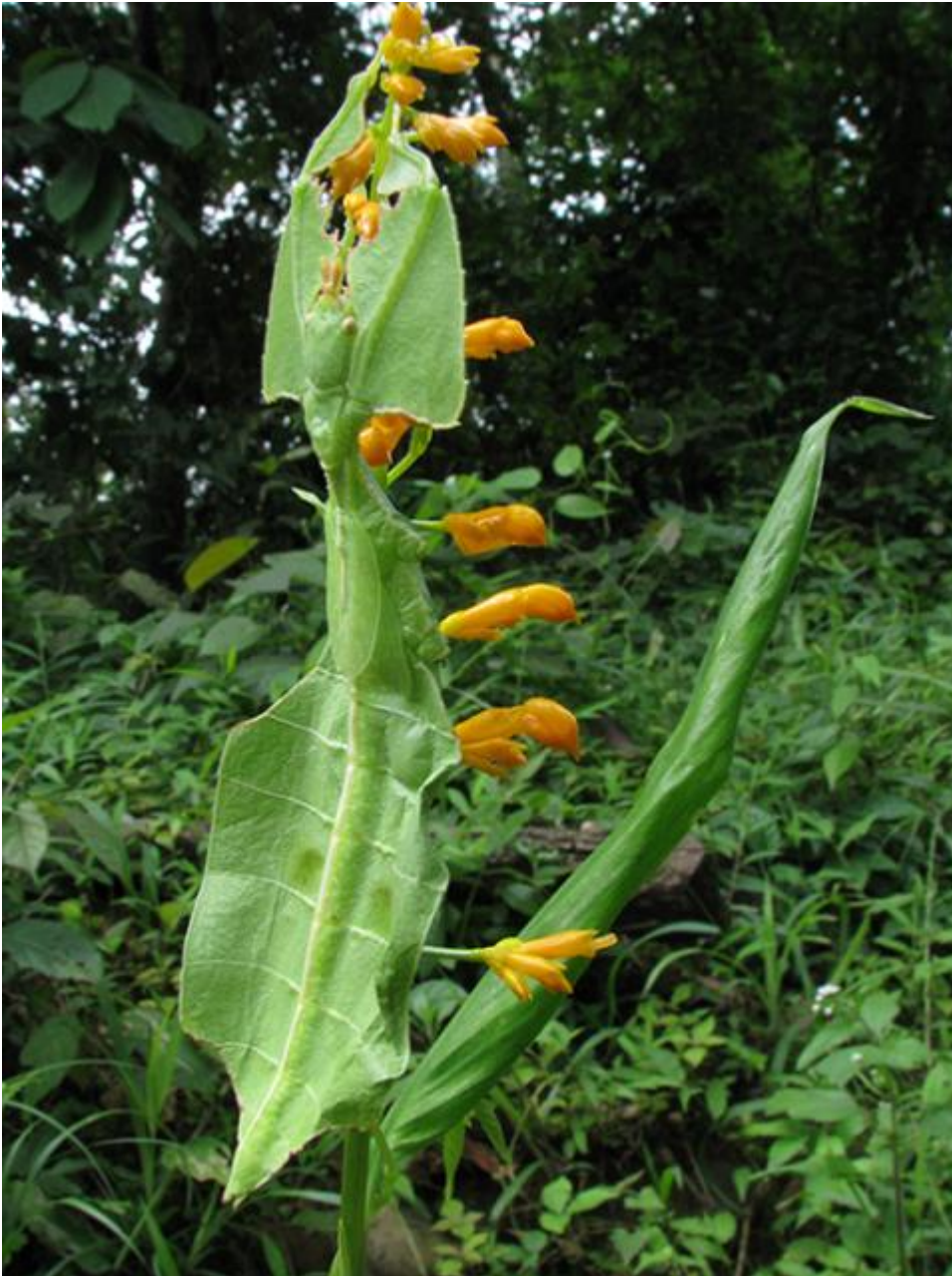
A leaf insect is pictured in Pakke Tiger Reserve in northeast India.

The society I live in is peaceful, but gradually, disbelief in basic goodness among people and peaceful living with each other is disappearing. We are constantly fed on the fear that paralyzes peaceful and harmonious living.