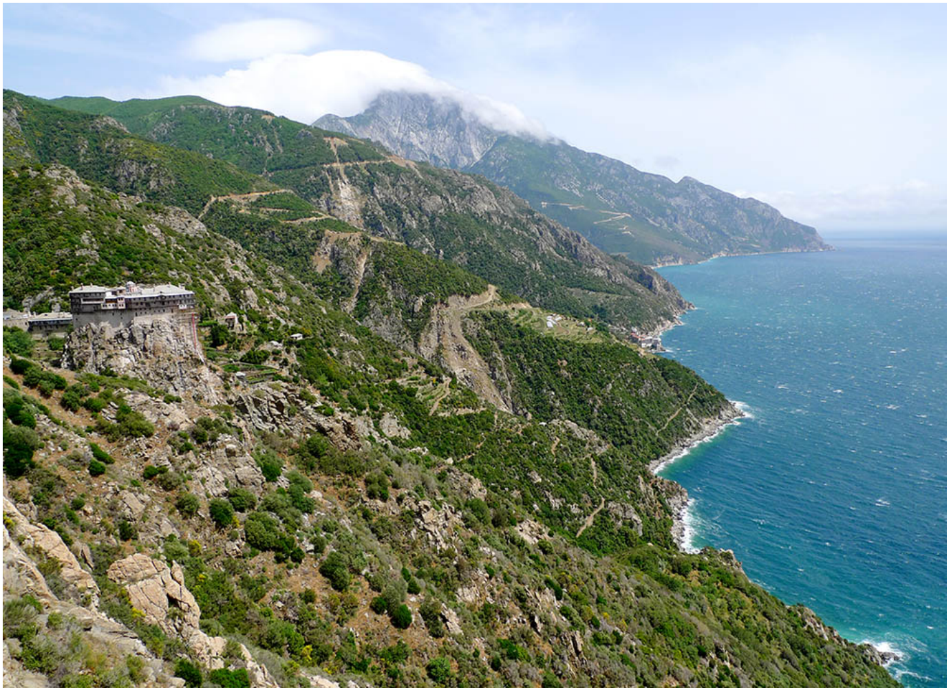
The Monastery of Simonos Petra is seen on Mount Athos in Greece.

The problem throughout this book, and I suspect most books about integralism suffer from the same problem, is that it is a sane analysis of madness. You make the same kind of marginal notes you do in other books — "strong argument," "good point," and "is this true?" — but then you put it down and wonder if you are still on planet Earth.