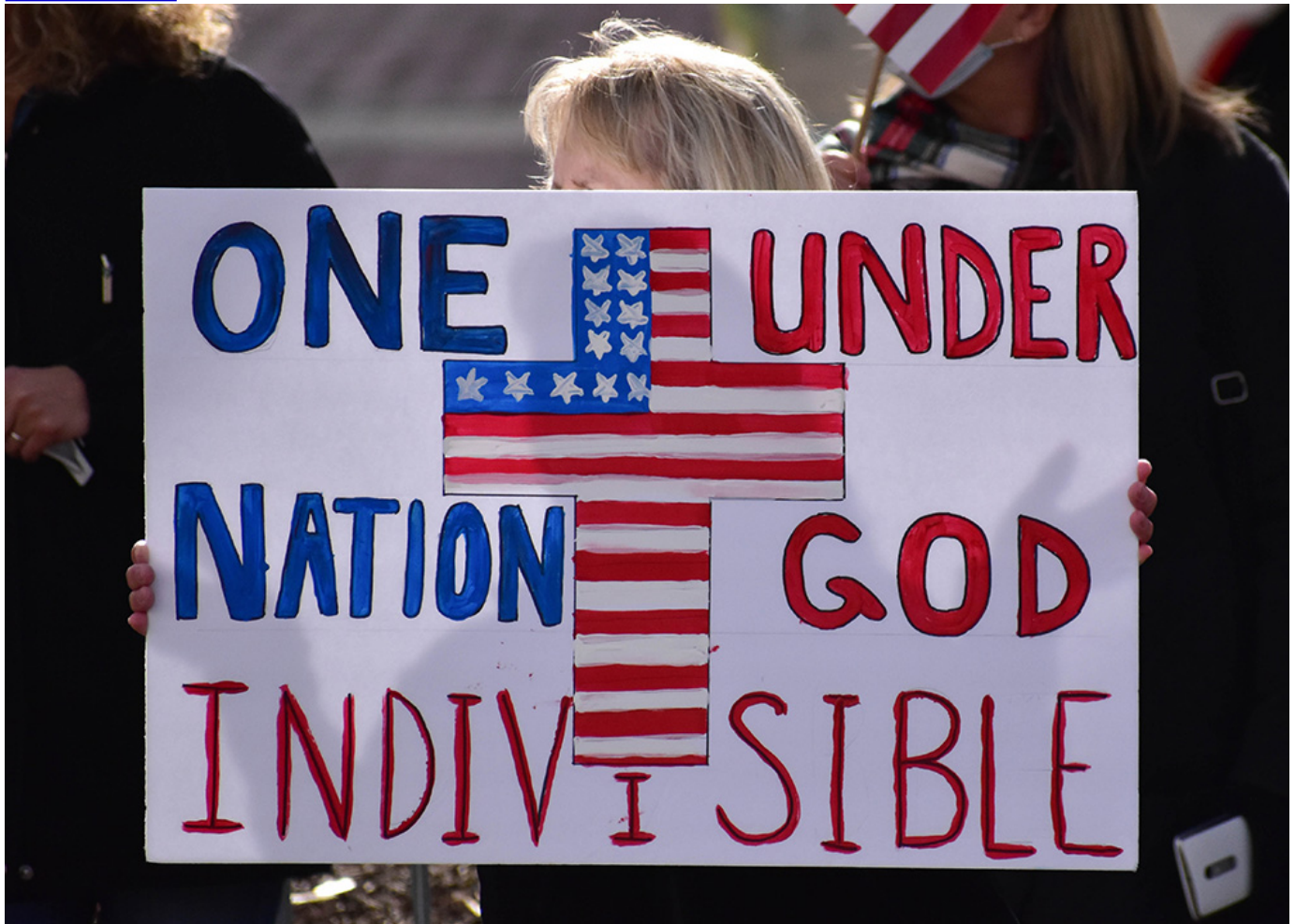
A "Stop the Steal" rally is held in Raleigh, North Carolina, on Jan. 6, 2021.