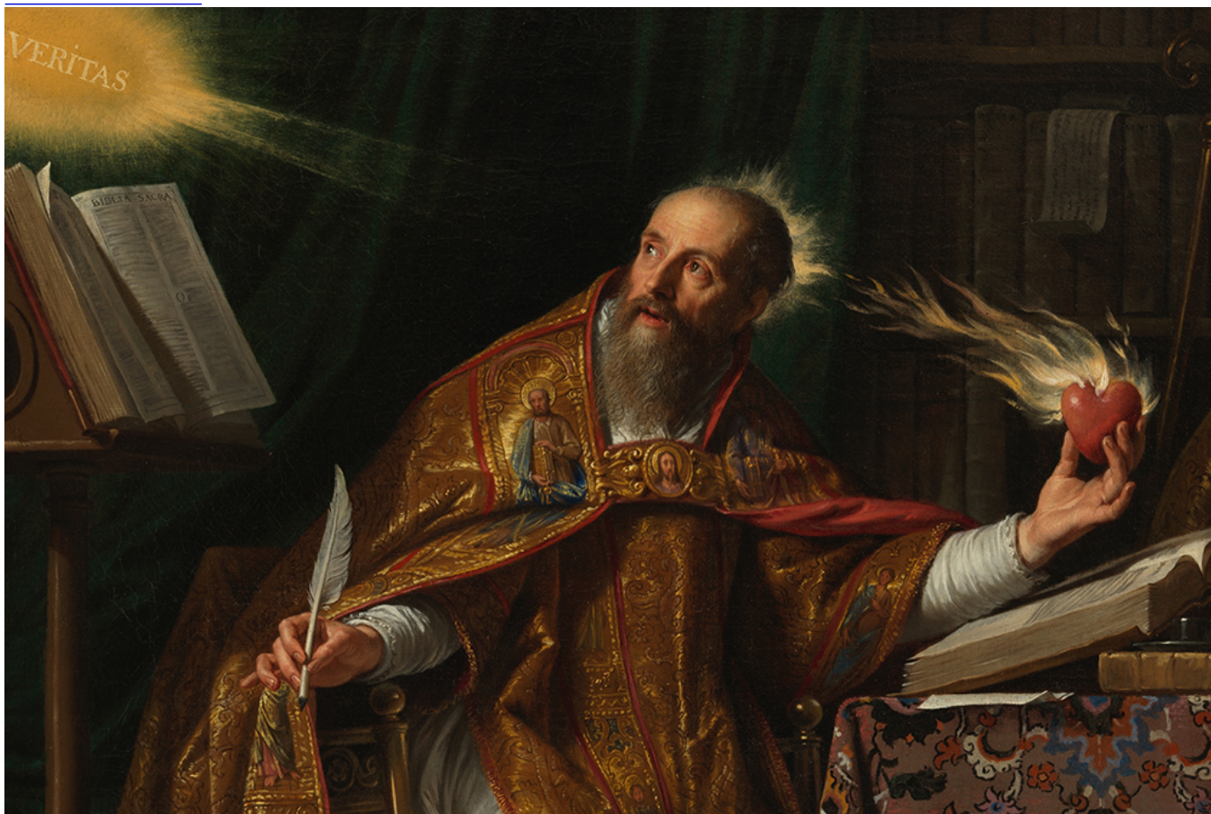
"Saint Augustine" (circa 1645), by Philippe de Champaigne