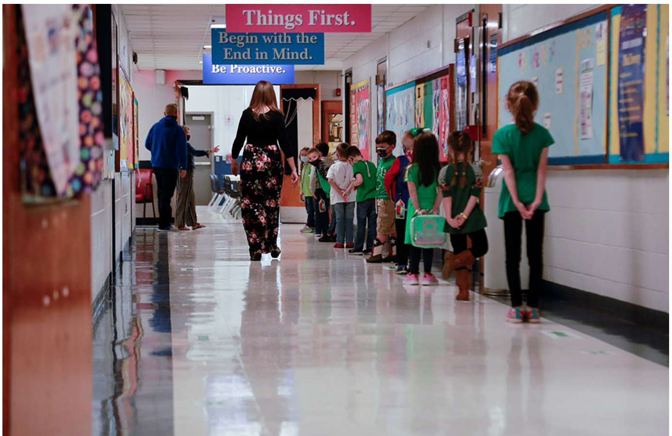
Students in Louisville, Kentucky, practice social distancing on the first day back to school March 17, 2021, after COVID-19 restrictions were adjusted.

We are here as survivors of a global pandemic that some in our midst still deny even happened. We are survivors of a global pandemic even though some of our population refused to sacrifice their personal convenience for the common good. We are still here because of leadership in the commonwealth that urged us to remember that we were all in the same circumstances and needed to care for and watch out for each other.