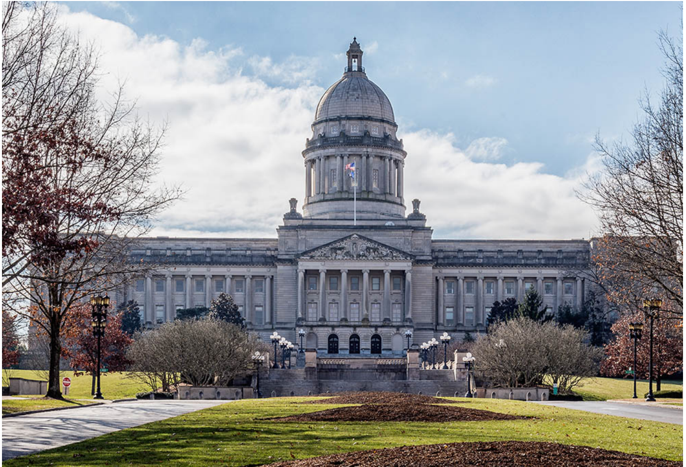
The Kentucky State Capitol building in Frankfort, Kentucky