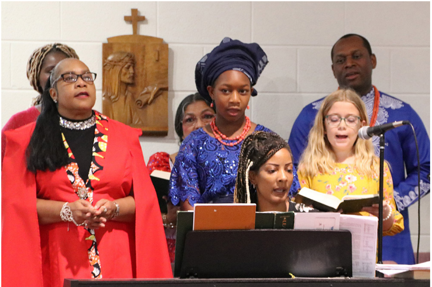
The choir leads the music during Mass at Rosary Chapel in Paducah, Kentucky, Oct. 16, 2022.

Hence the great document Gaudium et Spes of the Second Vatican Council, which treats the issue of the church's relationship with the world, begins by saying, "The joys and the hopes, the griefs and the anxieties of the people of this age, especially those who are poor or in any way afflicted, are the joys and hopes, the griefs and anxieties of the followers of Christ."