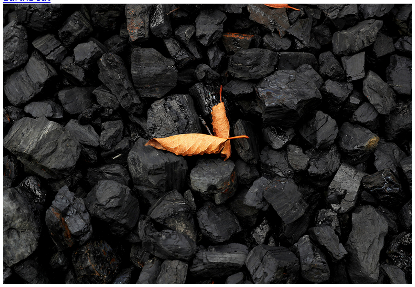
A leaf sits on top of a pile of coal in this illustration photo.