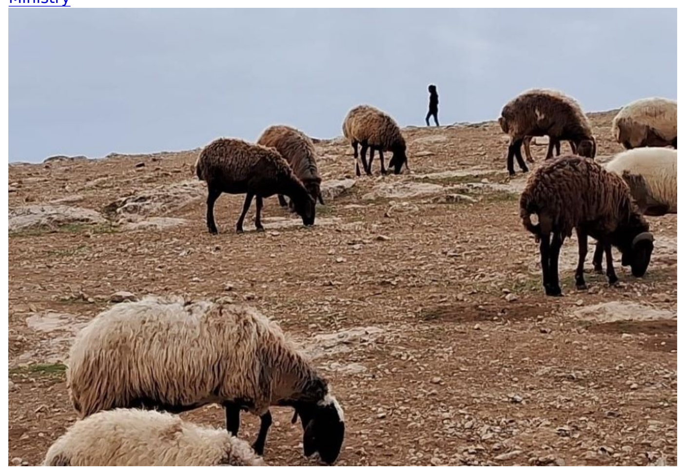
A Bedouin shepherd watches his flock in the Judean Desert.