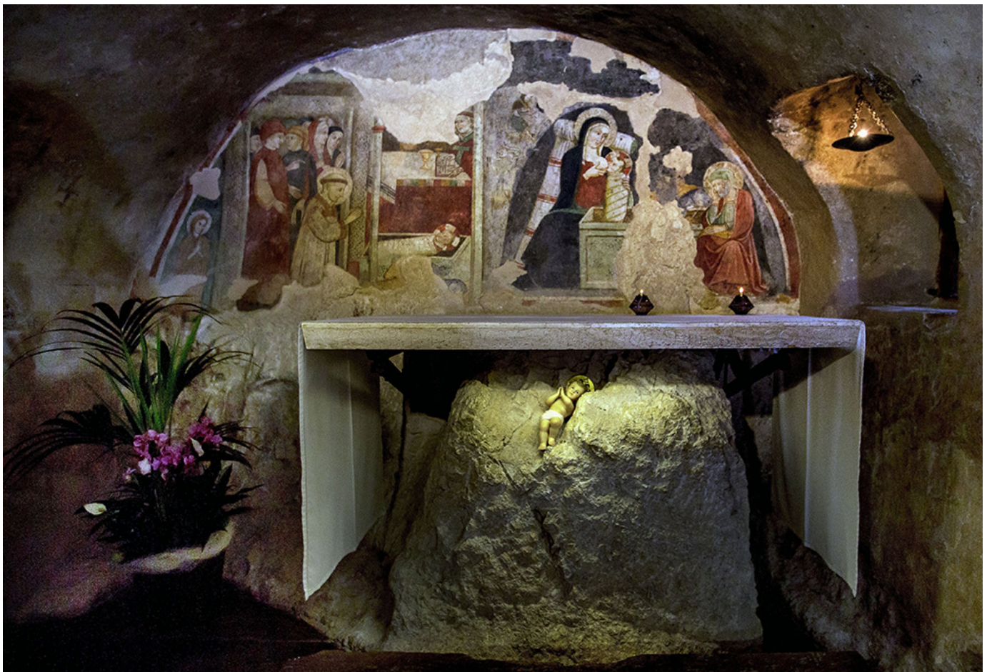
This 2013 file photo shows the fresco of St. Francis of Assisi adoring the baby Jesus in the Chapel of the Nativity in Greccio, Italy. The chapel is built in the grotto that