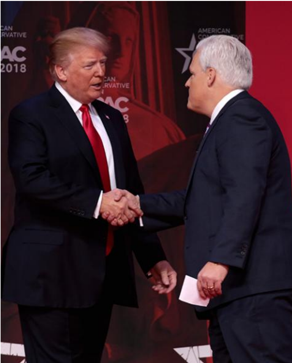
President Donald Trump greets Matt Schlapp at the Conservative Political Action Conference (CPAC) in National Harbor, Maryland, Feb. 23, 2018.