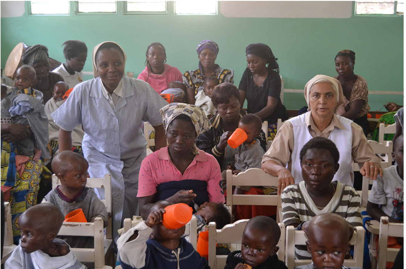
Daughters of the Resurrection in the waiting room of one of their clinics in the Democratic Republic of Congo