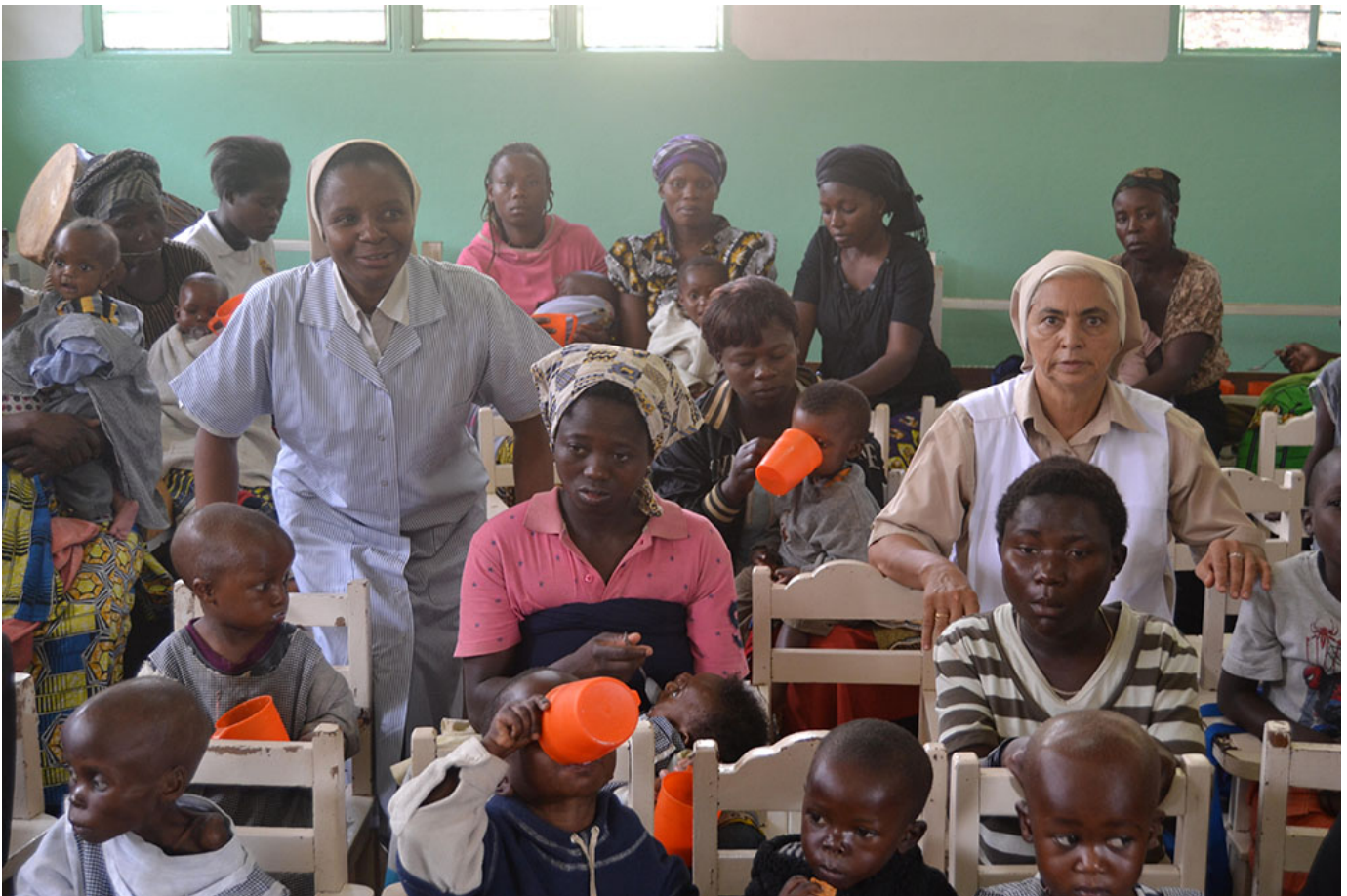
Daughters of the Resurrection in the waiting room of one of their clinics in the Democratic Republic of Congo