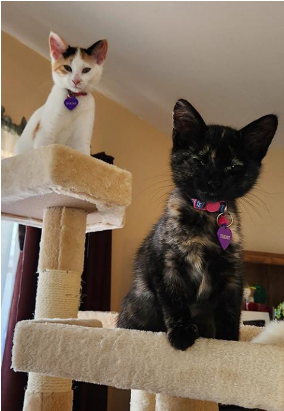
Rescue kitten siblings Snowdrop and Stardust

The two of them definitely heal my heart. Much like our community dog Oreo Cookie Monster before them, they know when I need extra attention, also known as healing.