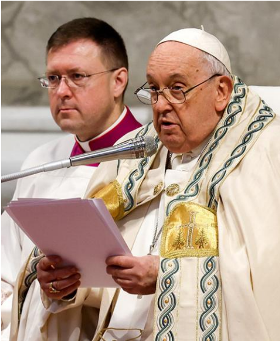
Pope Francis gives his homily during Mass for the feast of Mary, Mother of God, and World Peace Day in St. Peter's Basilica at the Vatican Jan. 1.

This year's theme focused on artificial intelligence and peace. Pope Francis, in a message , said, "The remarkable advances in new information technologies, particularly in the digital sphere, thus offer exciting opportunities and grave risks, with serious implications for the pursuit of justice and harmony among peoples."