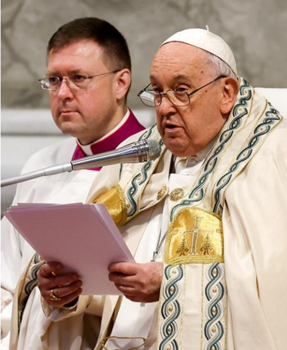
Pope Francis gives his homily during Mass for the feast of Mary, Mother of God, and World Peace Day in St. Peter's Basilica at the Vatican Jan. 1.

This year's theme focused on artificial intelligence and peace. Pope Francis, in a message , said, "The remarkable advances in new information technologies, particularly in the digital sphere, thus offer exciting opportunities and grave risks, with serious implications for the pursuit of justice and harmony among peoples."