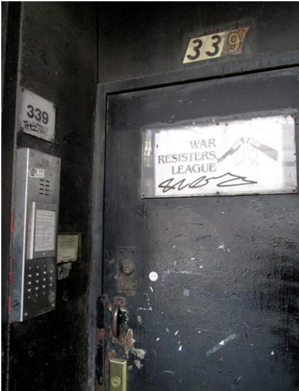
The front door of the building known as the "Peace Pentagon" is seen in 2016.