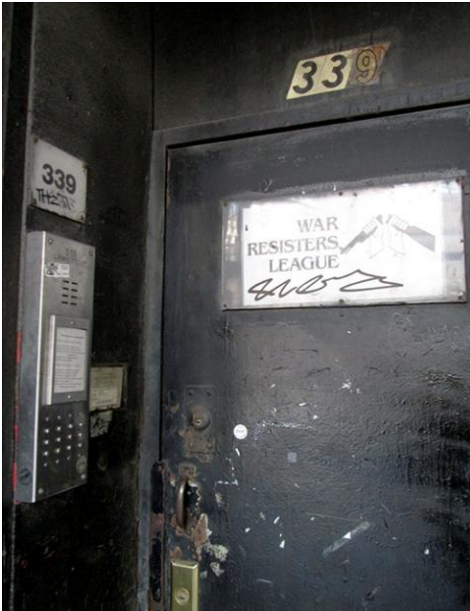
The front door of the building known as the "Peace Pentagon" is seen in 2016.