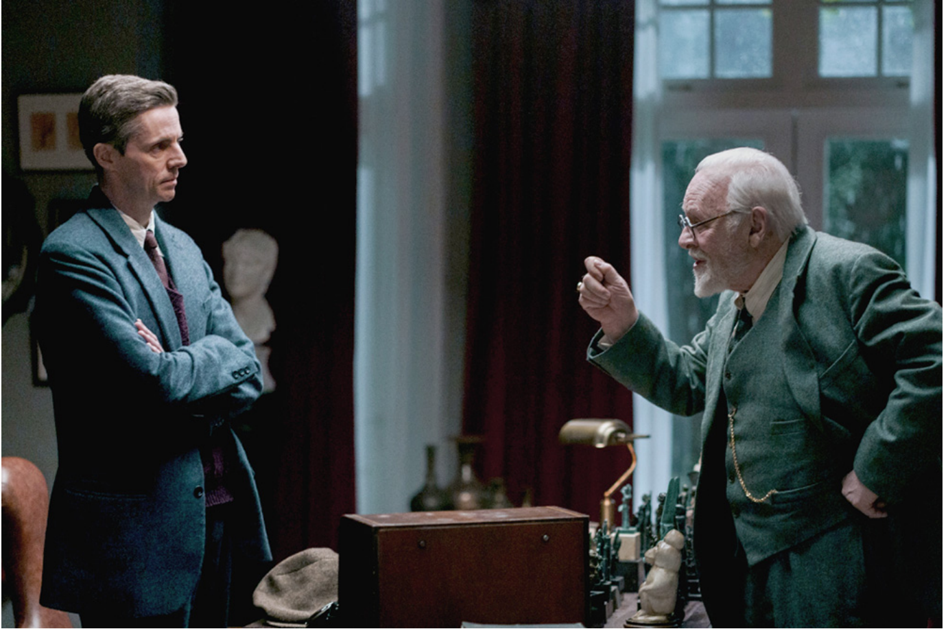
Matthew Goode as C.S. Lewis (left) and Anthony Hopkins as Sigmund Freud in the film "Freud's Last Session"