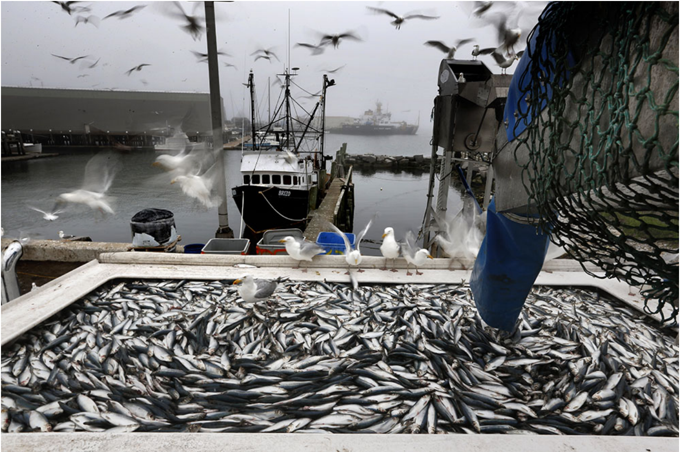
Herring are unloaded from a fishing boat in Rockland, Maine, July 8, 2015.