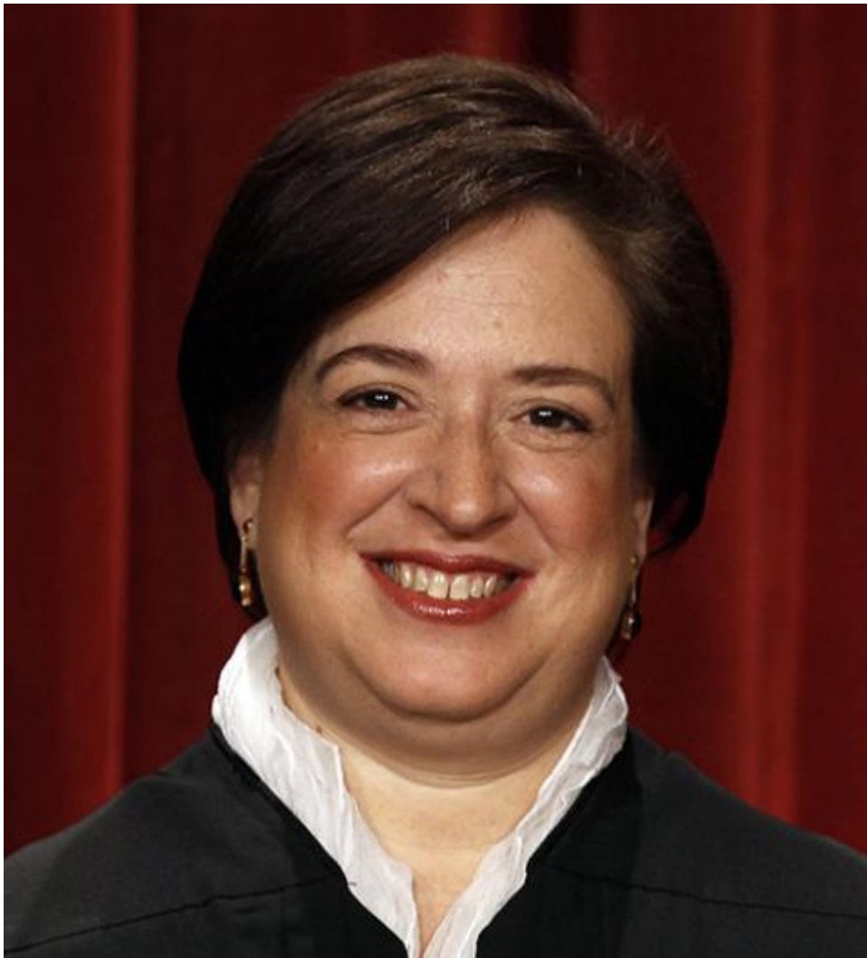
Justice Elena Kagan

Policy is equal parts law and facts. Law contains many components: the will of the people, national ideals, historic constitutional precedents, promises made on a campaign trail, etc. Facts are more particular and stubborn things. Or should be.