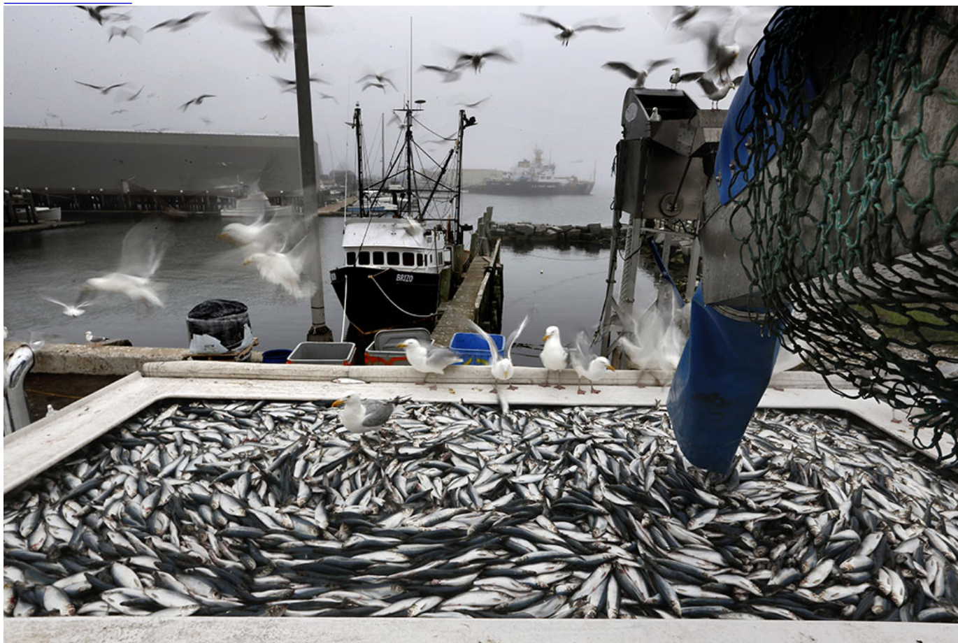
Herring are unloaded from a fishing boat in Rockland, Maine, July 8, 2015.