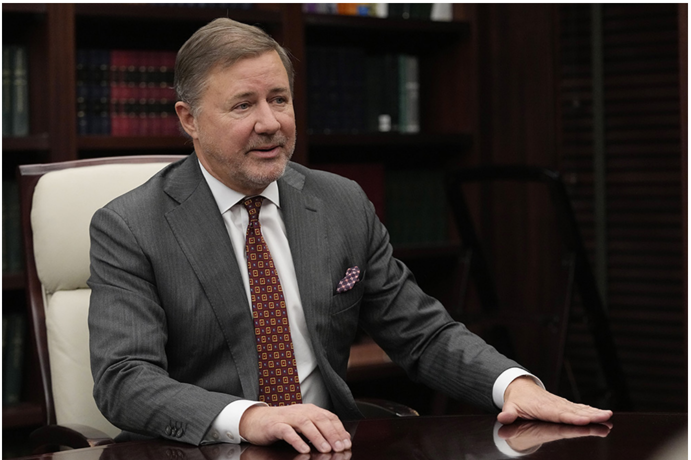
Oklahoma Attorney General Gentner Drummond

"There are believers that are confusing true religion — and religious liberty, and faith in God — with political power. And this Christian nationalism is the movement that is giving oxygen to this attempt to eviscerate the Establishment Clause," Drummond said.