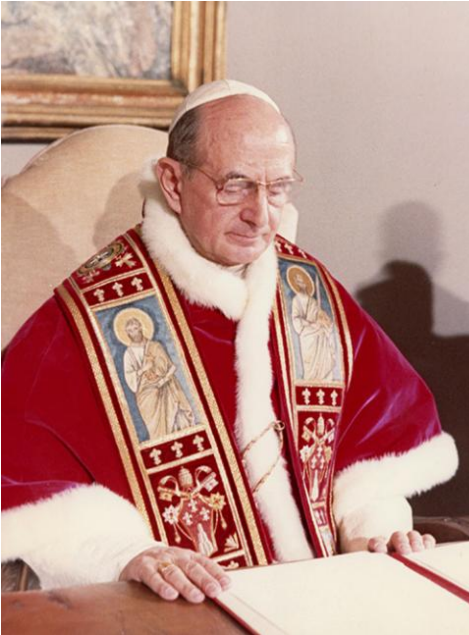
Pope Paul VI at the Vatican on June 29, 1968

Despite romantic fantasies about a better, nobler past, for most of history there was no expectation that men would treat women with basic respect, let alone "reverence." In the Hebrew Scriptures and the Homeric epics, men renowned for honor and heroism casually treat women as objects to be used and discarded. The practice of polygamy, widespread in many cultures in the past, allowed men to utilize women as toys for pleasure or tools for breeding.