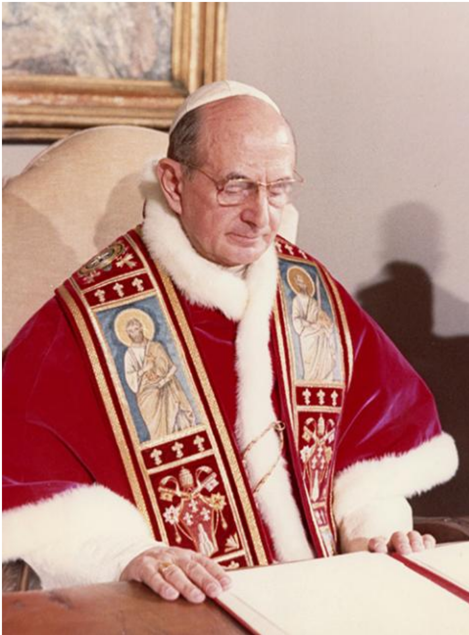
Pope Paul VI at the Vatican on June 29, 1968

Despite romantic fantasies about a better, nobler past, for most of history there was no expectation that men would treat women with basic respect, let alone "reverence." In the Hebrew Scriptures and the Homeric epics, men renowned for honor and heroism casually treat women as objects to be used and discarded. The practice of polygamy, widespread in many cultures in the past, allowed men to utilize women as toys for pleasure or tools for breeding.