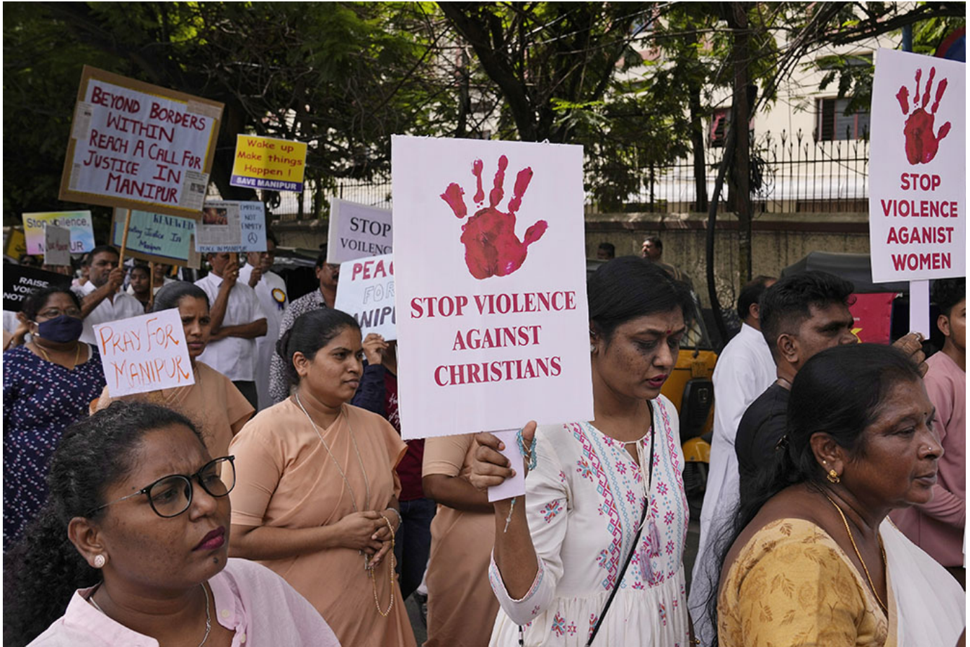
Catholic Christians hold placards and participate in a peace rally against violence in the northeastern Manipur state, in Hyderabad, India, Aug. 25, 2023.