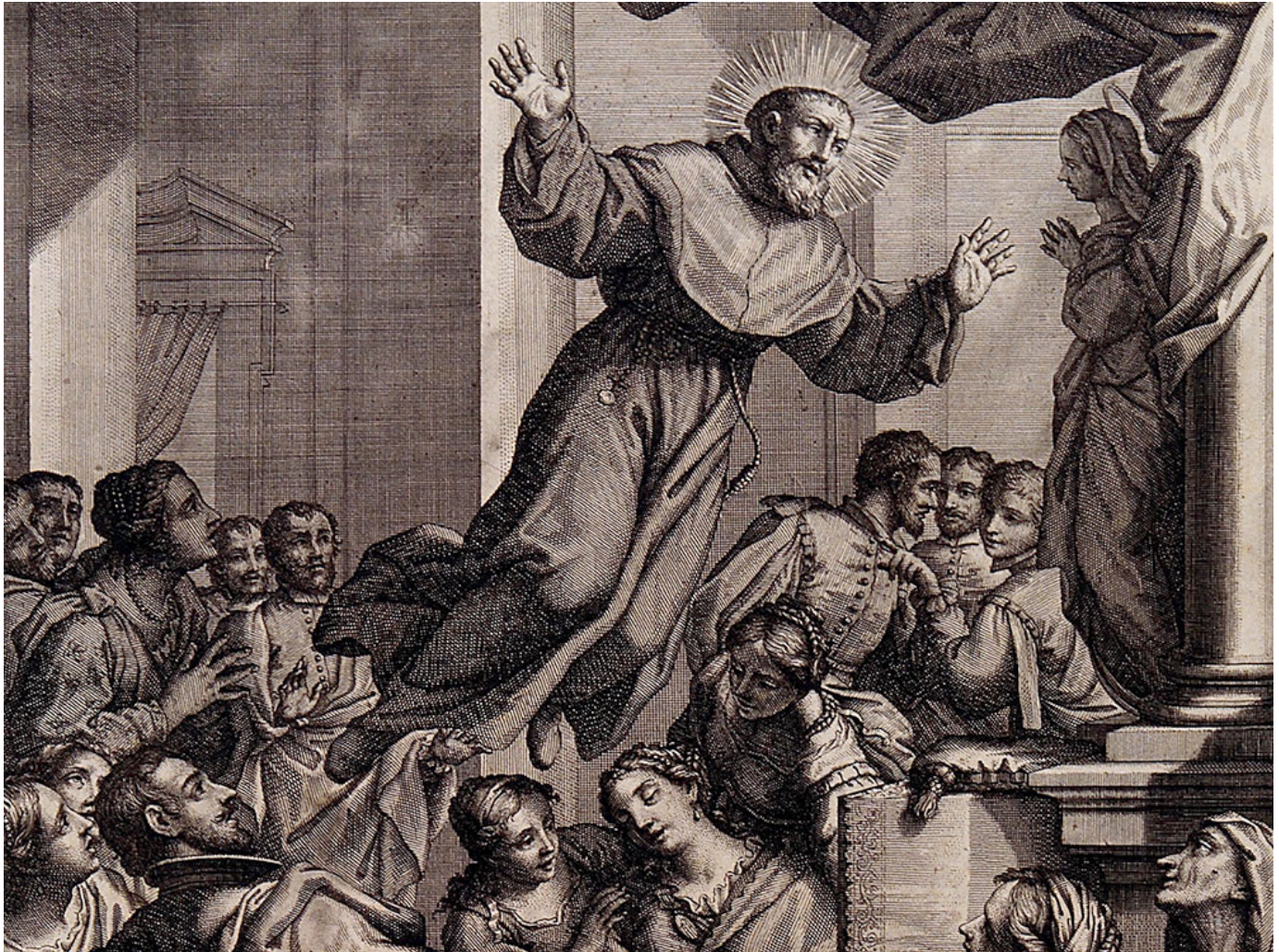
St. Joseph of Cupertino is depicted levitating in an 18th-century engraving by G.A. Lorenzini.