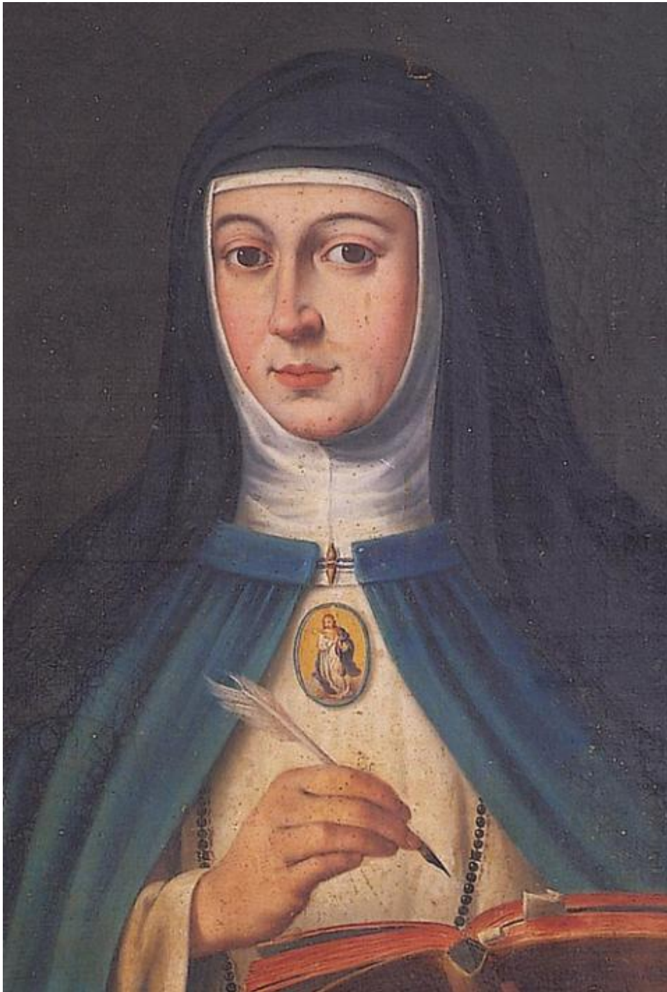
Detail of an undated portrait of Sor María de Ágreda

Masseo was a witness, but also a participant. Shortly after Francis ordered him to yield, Masseo obediently fell into his arms and was soon set aloft by the power of the saint's own breath.