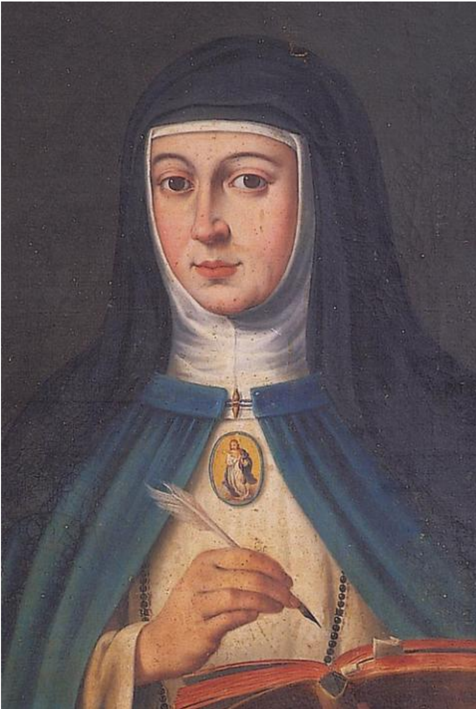
Detail of an undated portrait of Sor María de Ágreda