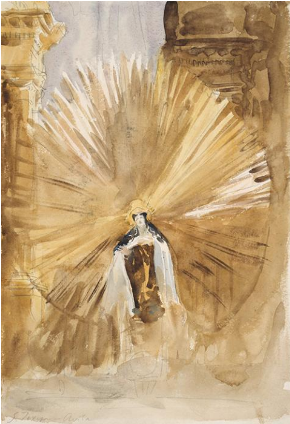
St. Teresa of Ávila in a circa-1903 watercolor by John Singer Sargent