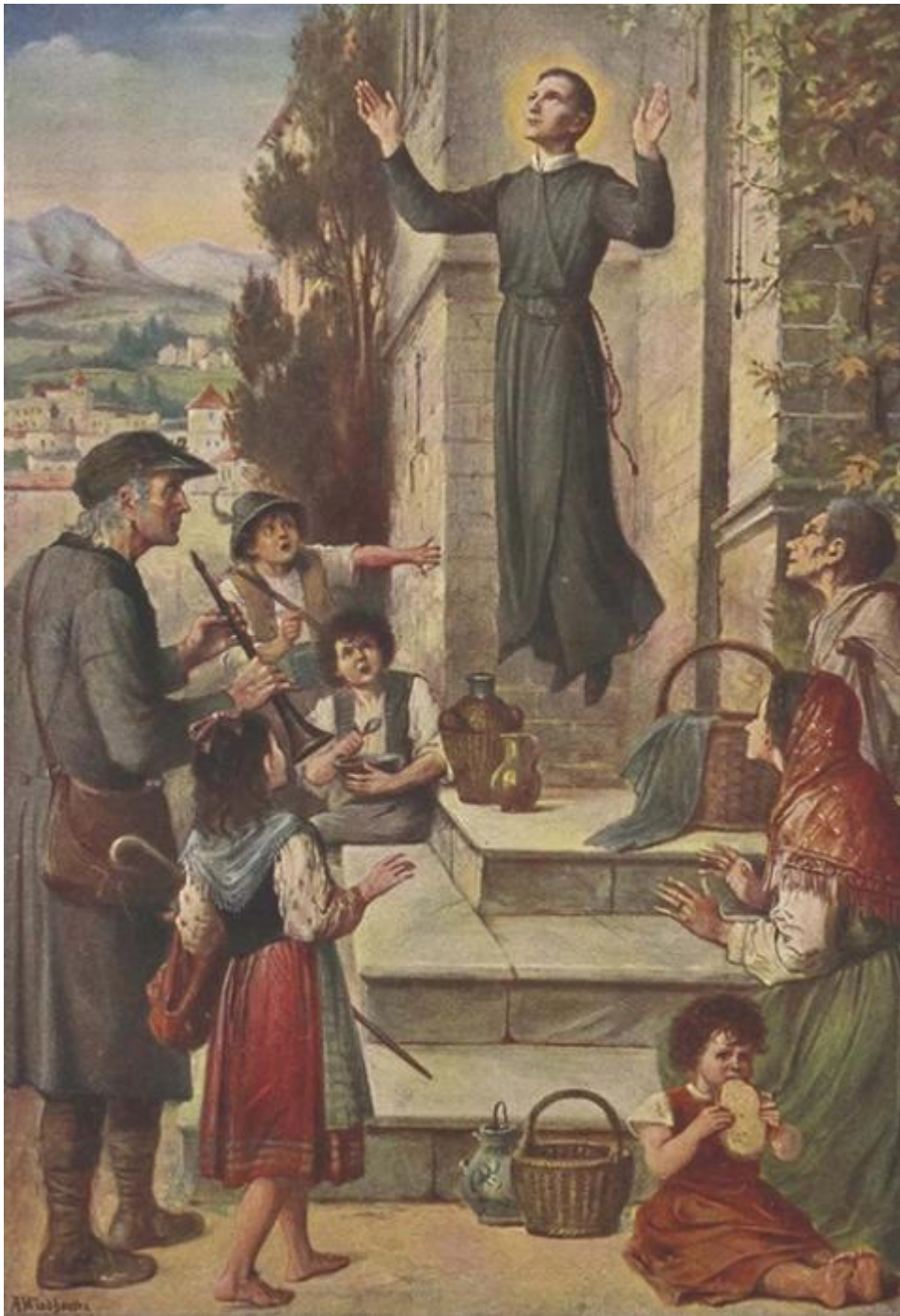
A 1918 illustration of St. Gerard Majella

The canonization records of St. Birgit of Sweden mention several astonished onlookers who saw her take wing. In Raymond of Capua's life of St. Catherine of Siena, we are told a story about Catherine's experience as a young girl enjoying being carried off the ground. "As a fish enters the water and water enters it," he wrote, "so her soul entered into God and God into it."