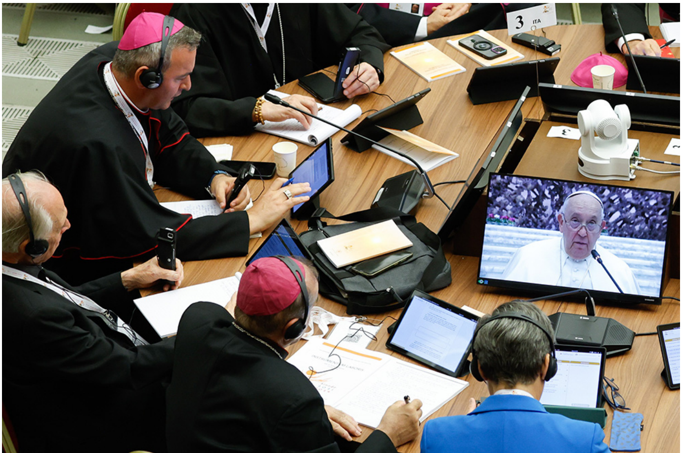
Participants watch Pope Francis on a video screen as they work on their tablets with synod documents during the first session of the assembly of the Synod of Bishops in the Paul VI Audience Hall at the Vatican Oct. 4, 2023.

There are some proposals that I find the most compelling and urgent.