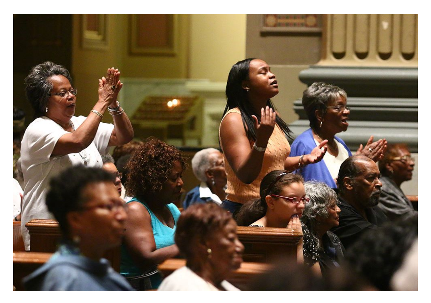
Black Catholics participate in a revival in the Cathedral Basilica of Sts. Peter and Paul in Philadelphia in this undated photo.

The incorporation of gospel music into the Roman Rite is in full continuity with the liturgical rubrics of the church. The early 1960s had already begun to witness the strivings of Black music ministers and composers who imagined ways that the liturgy could reflect the lived experience of Black Catholics. But the Second Vatican Council's call for the inculturation of the Mass was a watershed moment for Black Catholics and other communities as it provided opportunities for cultural expression in the liturgy that had previously never been possible.