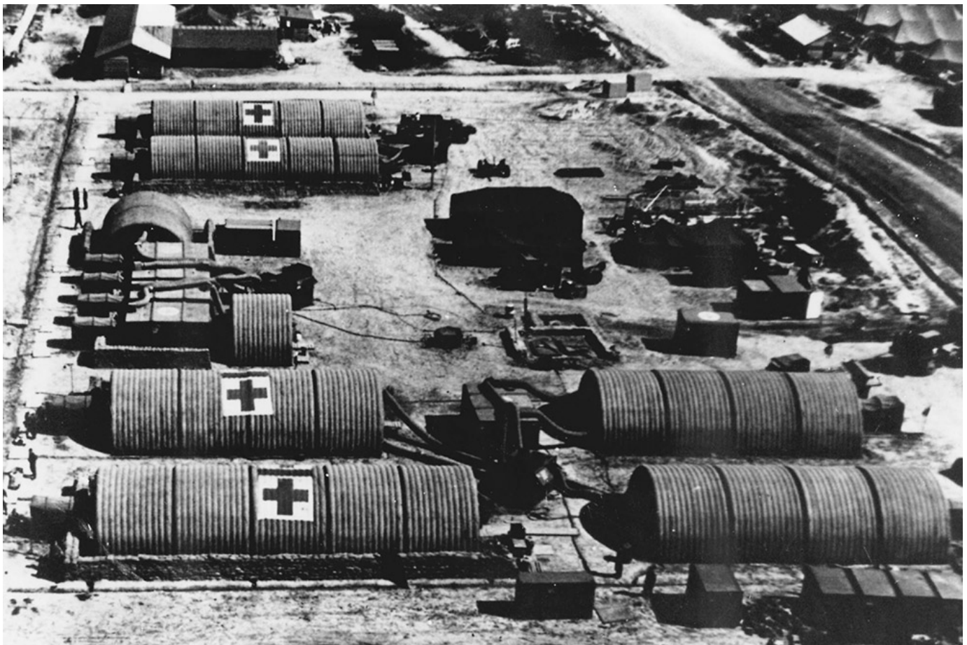
Medical Unit Self-Contained Transportable (MUST) at Fort Sam Houston in Texas, circa 1968