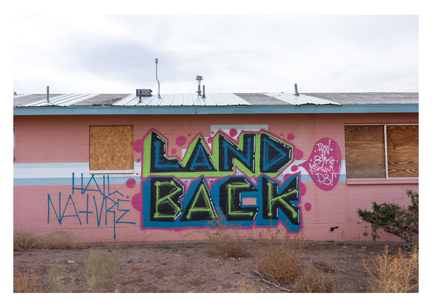
"Land back" wall art is pictured Nov. 23, 2023, near Monument Valley, Arizona.