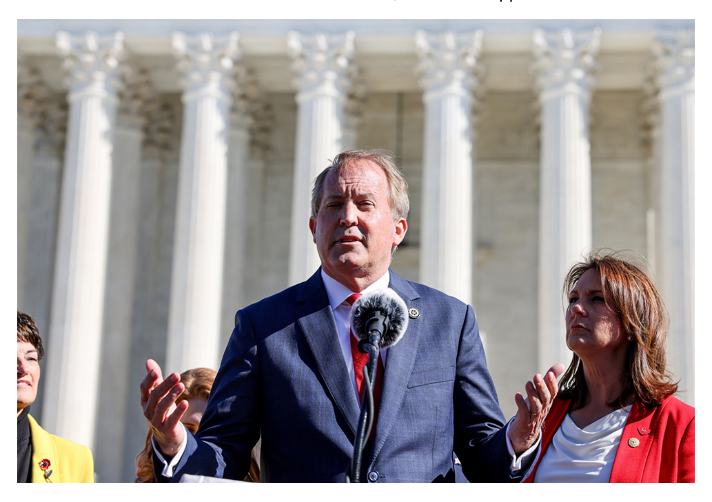
Texas Attorney General Ken Paxton speaks to pro-life supporters outside the U.S. Supreme Court Washington Nov. 1, 2021, following arguments over a challenge to a

Let's repeat that: Conscience and reason mediate religious convictions in the context of a pluralistic society. That pluralism looked very different in 1789 from what it does today. It is not true that America is a Christian nation, but it was, for most of its history, a nation of Christians, and the dominant cultural influence through the mid-19th century was Puritanism. As Alexis de Tocqueville famously observed, "I can see the whole destiny of America contained in the first Puritan who landed on those shores." The late 18th-century Puritans who ruled the New England states at the time of the founding supported the separation of church and state not because they had abandoned their theocratic sensibilities, but because they did not want the federal government infringing on the church establishments in their states. It was not until the 14th Amendment was ratified in 1868 that the Bill of Rights, with the First Amendment's disestablishment clause, was made applicable to state law.