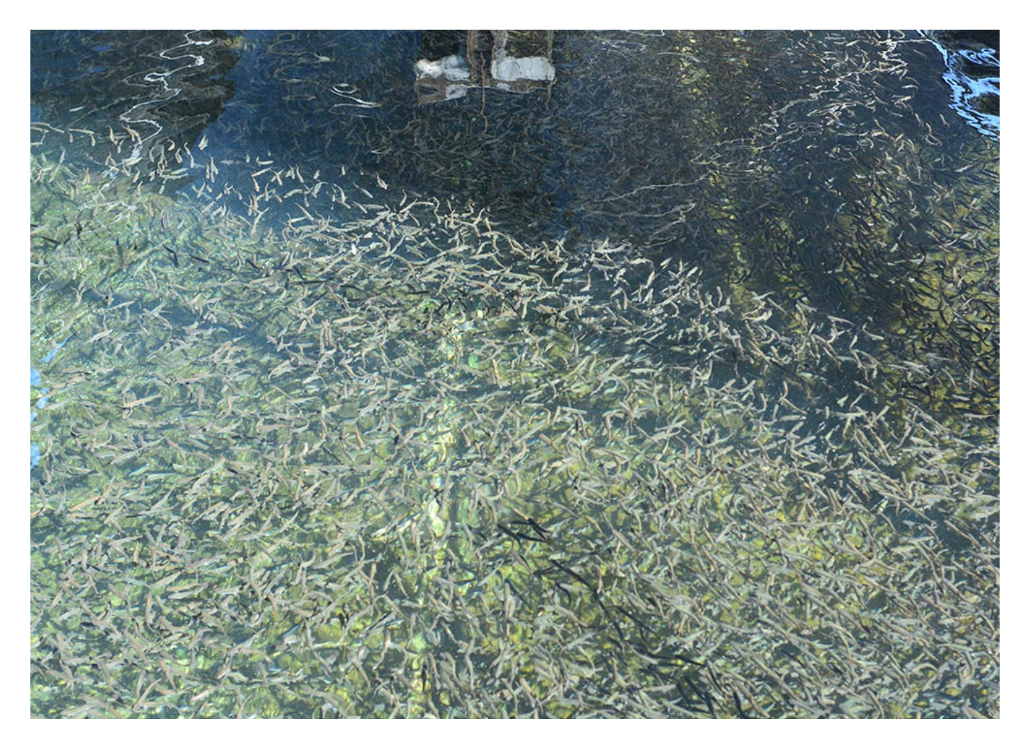
Fingerling Chinook salmon are seen at the Winthrop National Fish Hatchery in Winthrop, Washington, in 2023.

Salmon hatcheries, many operated by local tribes, artificially propagate salmon to support wild populations. But <u>hatcheries produce lower quality fish</u> and they aren't expected to survive as well as wild fish in the face of a changing climate. While hatcheries serve their purpose, it isn't the solution that would have the most impact for salmon.