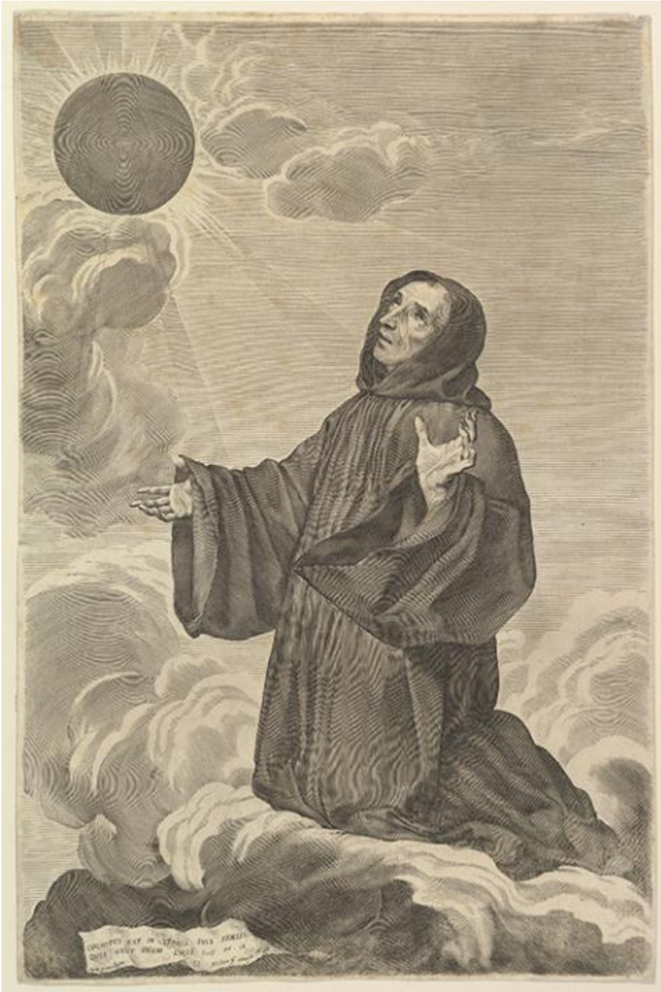
"St. Benedict in Ecstasy," by Claude Mellan

As I returned to work after my trip, I was faced with a question: What will benefit my students? Is it me trying to make a difference in their lives by coming up with the perfect lesson, the perfect solution to their problems? Or is it me "obeying" reality in the Benedictine sense â?? paying more attention to them and less to the little details of planning my lessons?