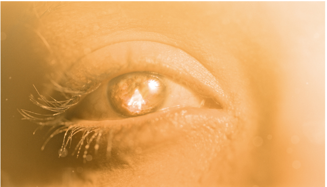
A still from the movie "After Death"