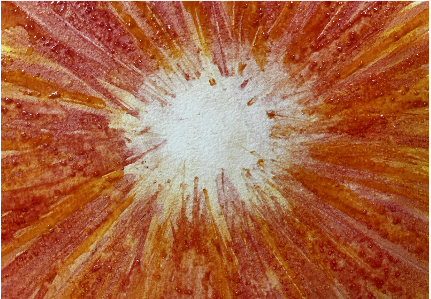
"Easter Morning Sun," by Sr. Paulette Kirschensteiner