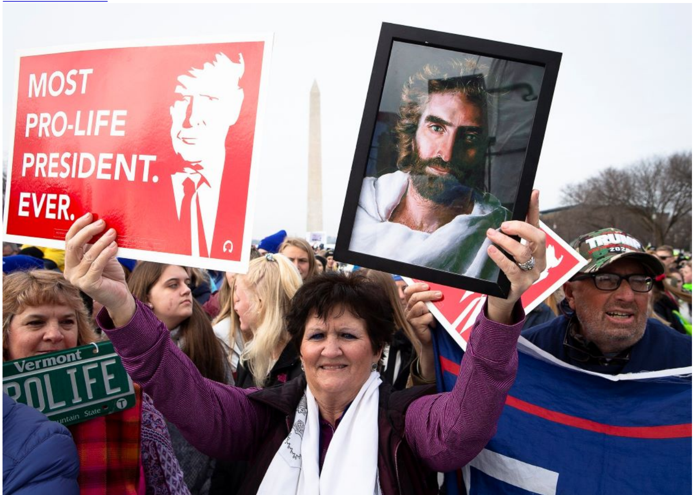
A woman holds an image of Jesus and a poster about President Donald J. Trump during the annual March for Life rally in Washington Jan. 24, 2020.