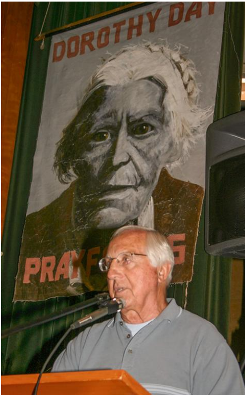
Bishop Thomas Gumbleton speaks at the Catholic Worker movement's 75th anniversary celebration at Our Lady of Mount Carmel-St. Ann Church and Parish Center in Worcester, Massachusetts, July 10, 2008.