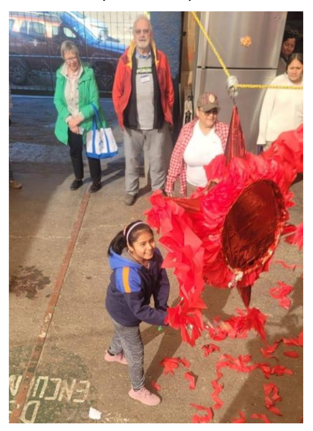
A child breaks a piñata at a shelter in Mexicali, Mexico.

One memory from our pilgrimage remains vividly etched in my mind. It was the moment we witnessed children laughing joyfully while hitting a piñata at a Mexicali shelter. Their laughter, innocence and resilience stood in stark contrast to the challenges they face. For a fleeting moment, as they picked their candies, selected