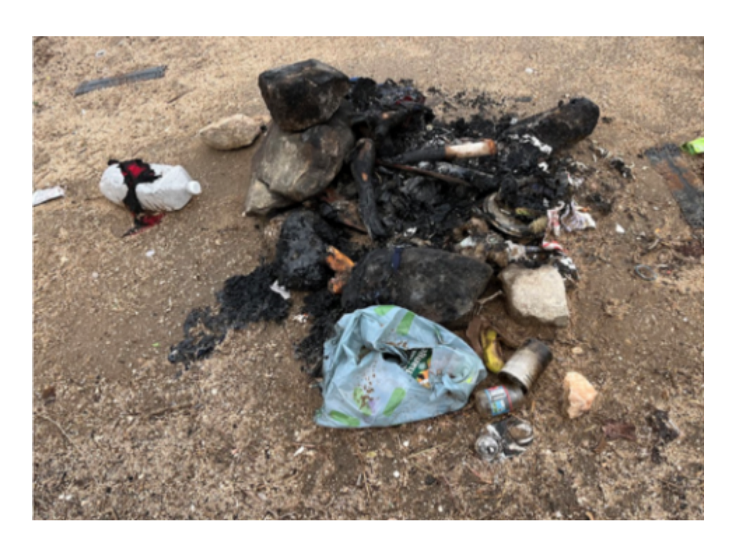
The fireplace at a migrant camp in Southern California border community of Jacumba

One of our initial stops was Our Lady of Guadalupe, a Jesuit-operated parish providing transitional housing for Spanish-speaking men. Here, we learned of the harrowing experiences of migrants. They shared tales of trekking for days, weeks, or even months, enduring perilous waters and inhospitable conditions to reach the border. Upon arrival, they often found themselves stuck in limbo for weeks to months, navigating the application process, attending hearings and awaiting their fate — a place of uncertainty. It served as a reminder of the immense sacrifices they made looking for safety and opportunity.