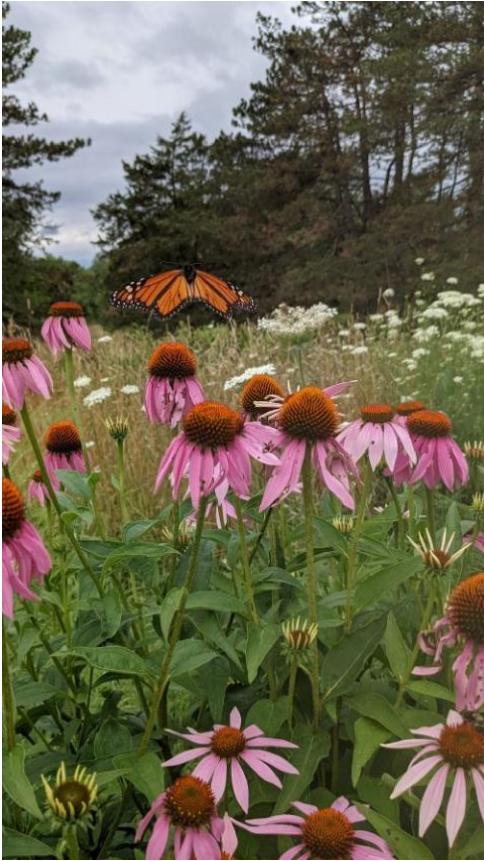
Flowers: In addition to land for farming, the Dominican sisters' property at Sinsinawa includes 10 acres of prairie and 10 acres of oak savanna.