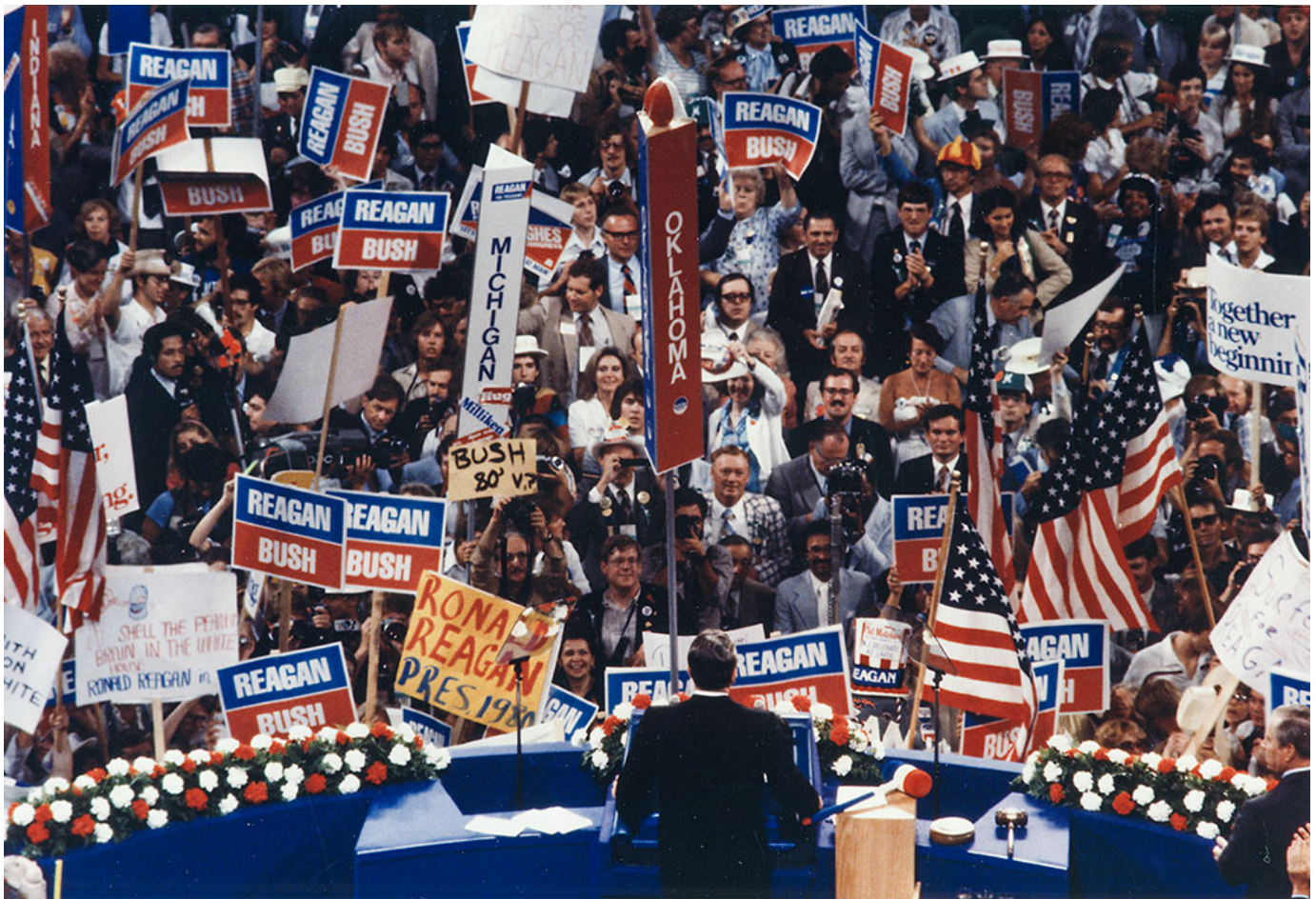
Ronald Reagan gives his acceptance speech as presidential nominee at the Republican National Convention in Detroit on July 17, 1980.

Such a realization raises the stakes on journalism's ongoing struggle to achieve objectivity — or, more realistically, to understand what objective tools work in service of the craft. It raises the stakes as well on the more difficult challenge of how to deal with easily demonstrated blatant falsehoods that are also widely accepted as truth.