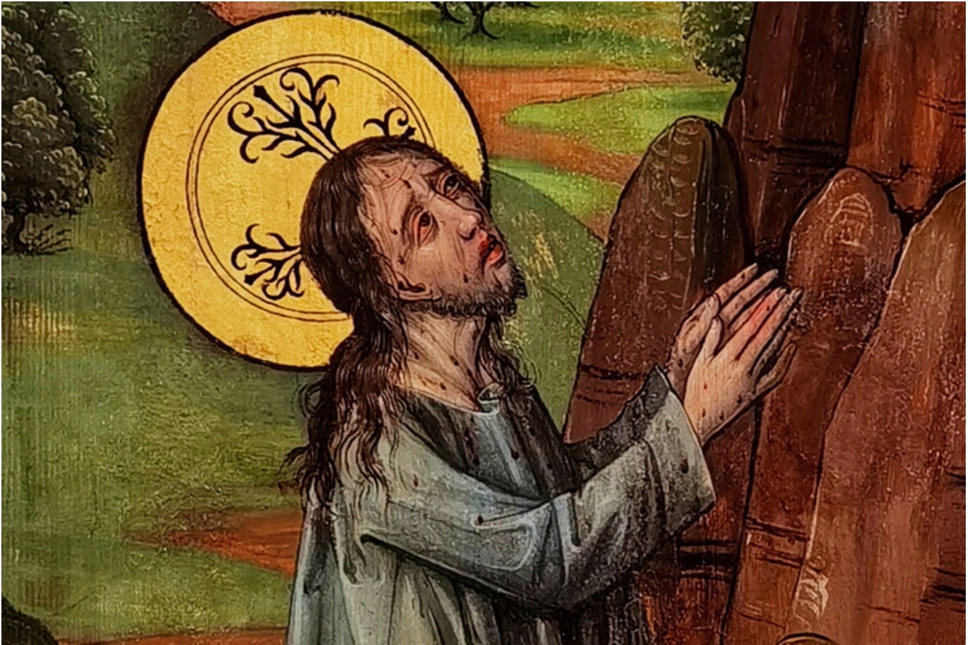
Detail from a 15th-century German altarpiece depicting the Agony in the Garden

The bovine nature of Jesus' salvific power was something Black Elk saw in his visions before his Catholic baptism. In his Great Vision of the Sacred Tree when he was 9 years old, he saw a red man roll in the earth and become a buffalo, then roll again and become sacred medicine.