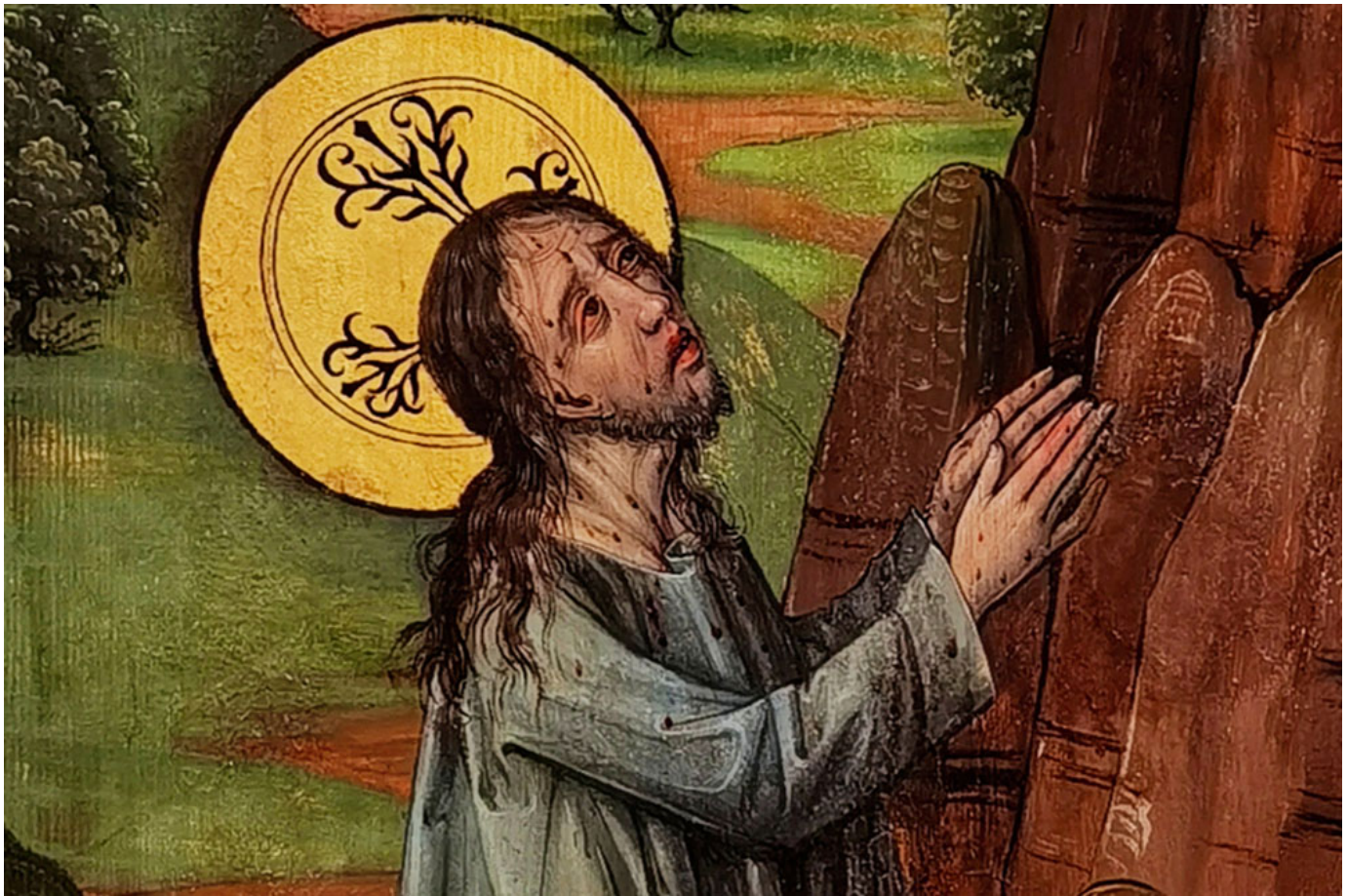
Detail from a 15th-century German altarpiece depicting the Agony in the Garden

The bovine nature of Jesus' salvific power was something Black Elk saw in his visions before his Catholic baptism. In his Great Vision of the Sacred Tree when he was 9 years old, he saw a red man roll in the earth and become a buffalo, then roll again and become sacred medicine.