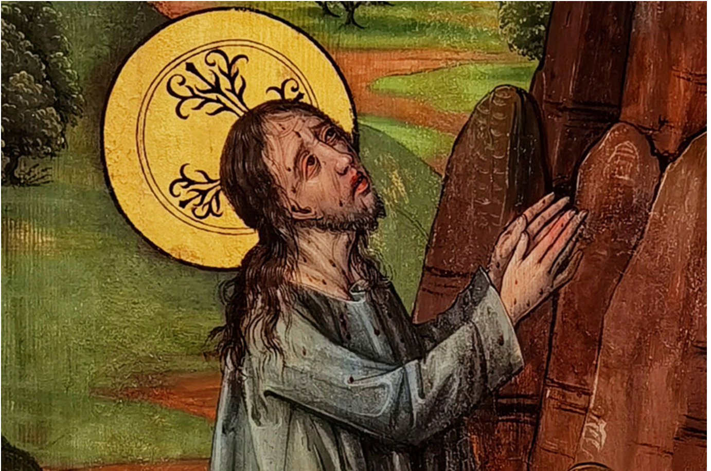
Detail from a 15th-century German altarpiece depicting the Agony in the Garden

The bovine nature of Jesus' salvific power was something Black Elk saw in his visions before his Catholic baptism. In his Great Vision of the Sacred Tree when he was 9 years old, he saw a red man roll in the earth and become a buffalo, then roll again and become sacred medicine.