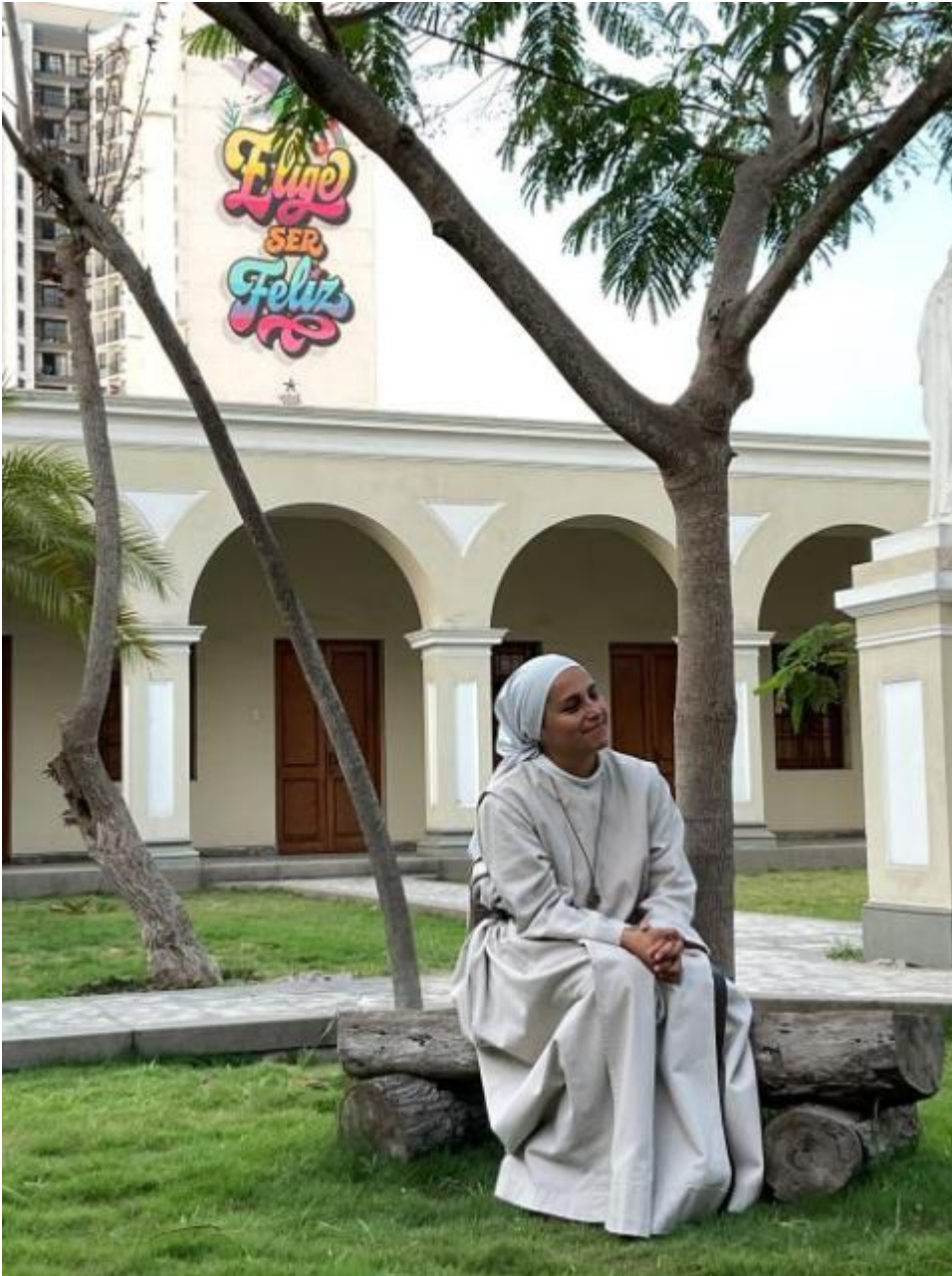
A sister prays in the cloister of the Monastery of the Incarnation in Lima, Peru.

live in pursuit of the comfort of a life with few surprises and, at the same time, with some emotions that embellish it.